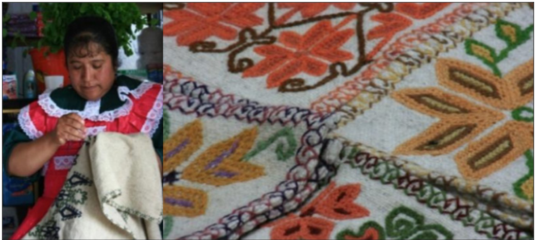
FIGURE 1: A PHOTOGRAPH TAKEN WITHIN THE COMMUNITY SHOWING A WOMEN TAKING PART IN TRADITIONAL HAND TEXTILE CRAFTS AND THE MATERIAL PRODUCED.

The primary method of data analysis involved the codification of answers by highlighting phrases and words which were mentioned multiple times. A colour coding system was adopted in order to show the relative importance of each significant phrase. Words and phrases were deemed of higher significance based on the number of repetitions of similar phrases amongst respondents.