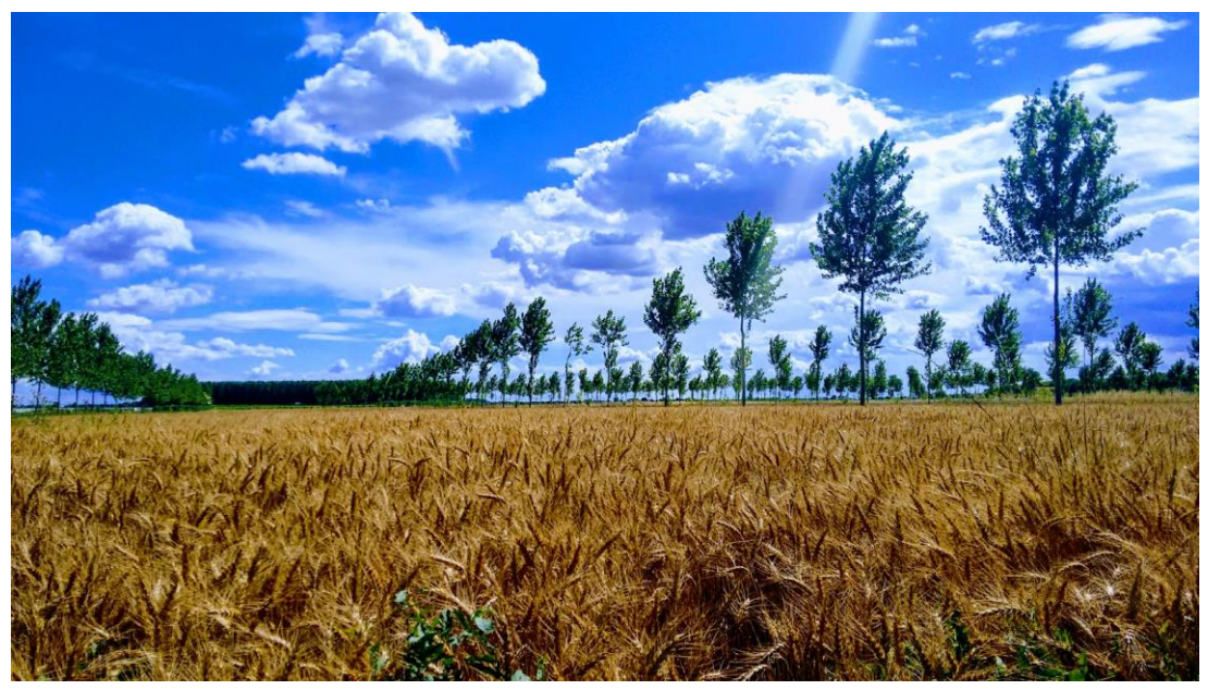
Fig 4. Linear planting of poplar and oak along drainage ditches in Masi (Padova), Italy.

Agroforestry on arable lands can improve land productivity, reduce pollution and address climate change by sequestering more carbon than conventional arable systems. CNR-IBAF, Veneto Agricoltura, the University of Pisa and the Sant'Anna School of Advanced Studies in Pisa have investigated the effects of tree buffer strips along field margins and drainage systems and silvoarable systems on wood production and environmental benefits (Fig 4). Borin et al. (2010) reported the positive effects of such systems on reducing pollutants in runoff water, reducing nitrogen leaching and increasing carbon sequestration. Although the wood production component of the system was often unprofitable (Borin et al. 2010), the use of fuelwood for self-consumption is often practiced and difficult to evaluate.