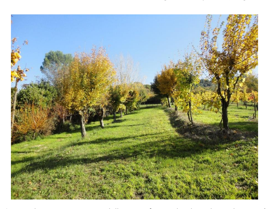
Fig 2. Coltura promiscua in a hilly area of central Italy with maple trees (Acer campestris L.) along terrace ridges supporting grapevine and with hay intercropping in between the trees

trees were perceived as an obstacle to agricultural machines and were eradicated from the fields. However, some relicts of tree rows and vines can still be found (Fig 3) and they are increasingly recognized for their heritage value as a living archive of the coltura promiscua historical landscape (Ferrario, 2012). Although the coltura promiscua cannot be revived as it was in the past, it could provide a basis to understand the mutual behavior of different crops and new forms of multifunctional and sustainable agriculture systems (Lang et al. 2018).