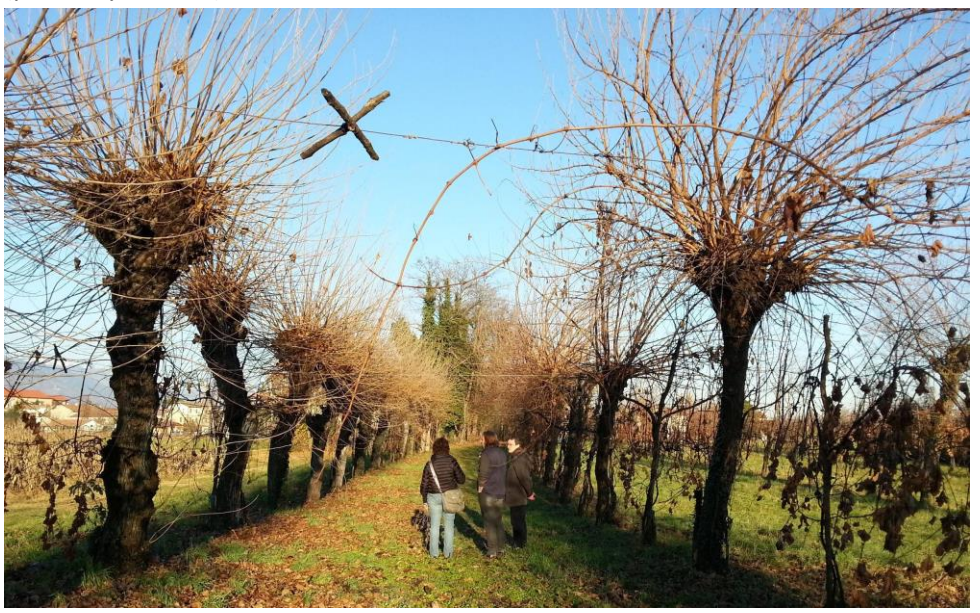
Fig 3. Coltura promiscua in the fertile alluvial area of northern Italy with poplar trees supporting grapevine. Trees crown is periodically lopped for reducing the shade on the understory. Pruning was used in the past for fuelwood, hay (fresh shoots with leaves), and basketwork (photo by M. M. Turato, 2013).