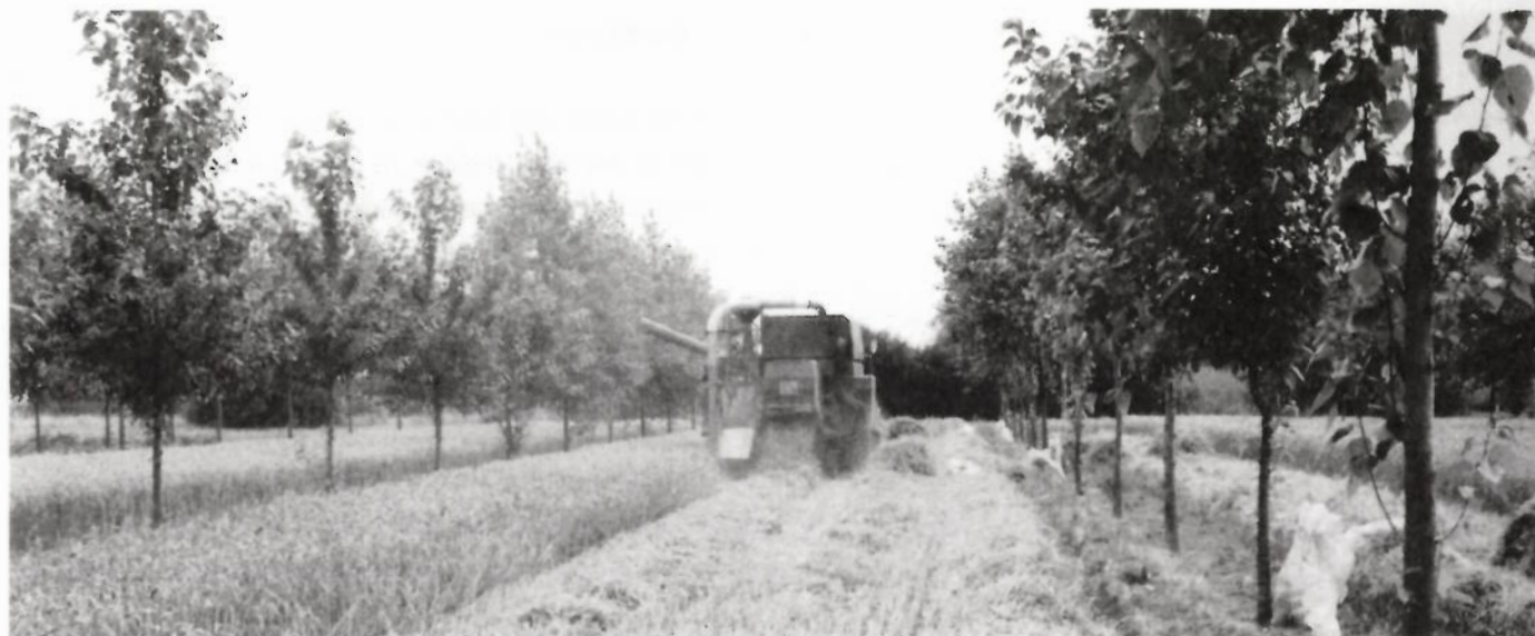
Figure 1. Winter wheat harvest with rows of poplar 10 m apart in the 5th growing season. Silsoe College, Bedfordshire (Cranfield University).