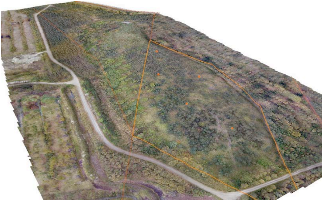
Figure 2: 3D site topography based on DTM with 50 cm resolution and draped orthophoto

was conducted for visualisation of topography before the physical exploration of site was carried out. Topographic and morphologic 3D characterization of the site will obtain a detailed reconstruction of the topographic surface. This will give better overview about structure and composition of the investigated pilot site. Photogrammetry is a viable alternative for calculating landfill volume which is useful for the SRM's volume evaluation on site. Figure 2 shows an orthophoto of the Vierumäki industrial landfill site with cell size of 5 x 5 cm.