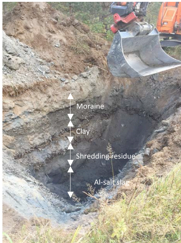
Figure 4: Landfill layers at the Vierumäki industrial landfill.

After excavating the cover layers (moraine and clay) and the two waste layers were mixed together to obtain a representative composite sample from the excavated waste materials as summarised in Table 2