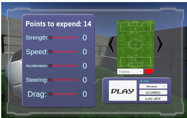
Fig. 4. This figure shows how the children can distribute their points into several characteristics that will affect the behaviors of the bots of their teams.

It is important to note that the evaluation performed by the coaches is based on the children’s behavior in the real, e.g., this evaluation is based on how the kids behave during the training sessions, in the matches, etc. If they behave according to the values learnt, they will be evaluated higher and they will have more points