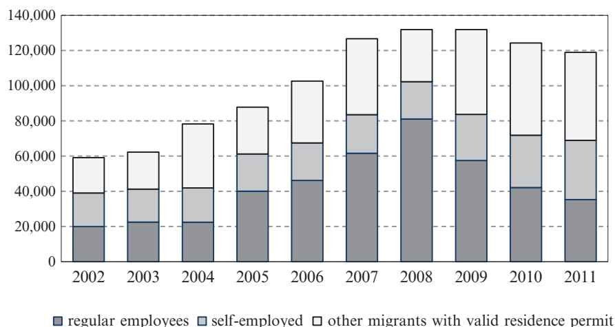
Fig. 8.1 Registered economic activities of Ukrainian nationals