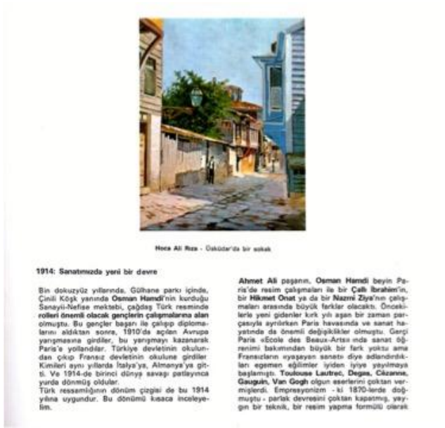
1914: Sanatımızda yeni bir devre