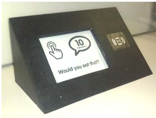
Figure 1: Deployed displays consisting of a 6 inch e-ink screen and black casing to fit in with gallery environment.

The deployed displays were inch scale (Weiser, 1991) interactive screens affording both direct touch interaction and mobile interaction via a related web application for visitors to submit and browse comments for specific exhibits (Figure 1).