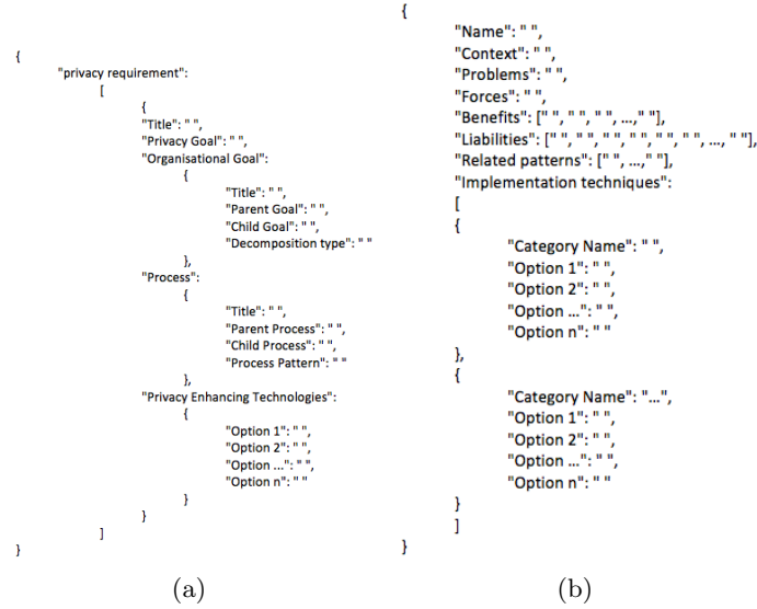
Fig. 2: PriS and Privacy Process Pattern JSON template