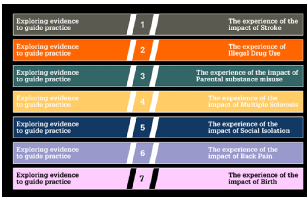
Figure 2 – Case List (EVP 01 – EVP 07)

From the beginning of 2010, academic champions for each case study were identified and invited to complete a pro-forma with their initial ideas. They were prompted to look at The Carer's World as this might give them some useful ideas on how they might want their case to be designed. Academics were also advised that at the beginning of the creative process, the information supplied and the layout or design was not finalised, so that they could build their case studies iteratively before the actual live date. They were also requested to include a narrative from the person's perspective which could be written, or be from a video clip from Healthtalkonline (2011) or another similar resource.