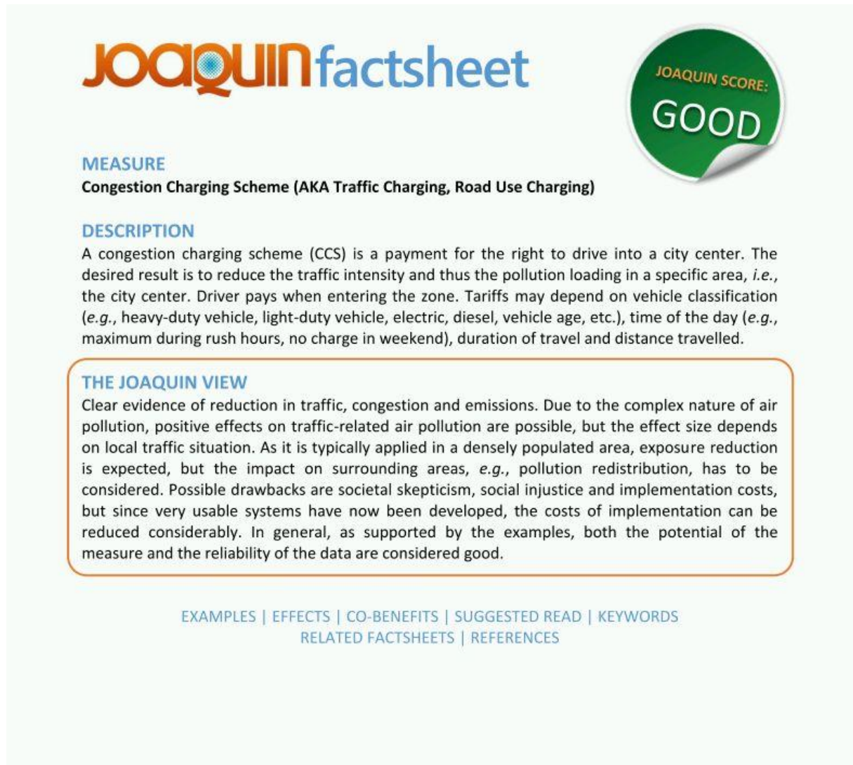
Figure 3: Factsheet main page