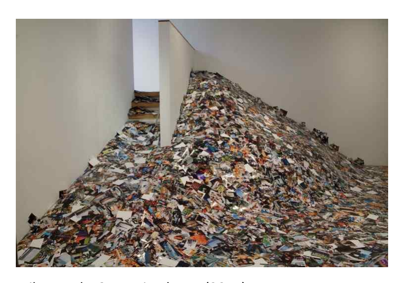
Erik Kessels, 24 Hrs in Photos (2014)