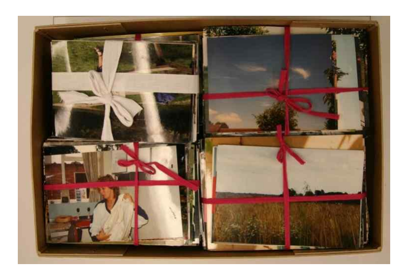
Annebella Pollen, Box 19 in the One Day for Life archive (2013)

View of Box 19 in the One Day for Life archive, University of Sussex Special Collections, UK, 1987