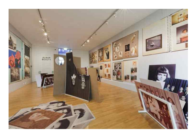
Erik Kessels, Album Beauty (2012)

'found' photographs – those usually vernacular images from family albums regularly apprehended for sale in junk shops and second-hand markets – already carry an elegiac quality, this project ramped up the mourning. In the Archive of Modern Conflict's words, Shining in Absence is not only about the passing of a friend but also something much more major: it "is about the space left by the disappearance of photography as both an idea and as a material object." (n.p.)