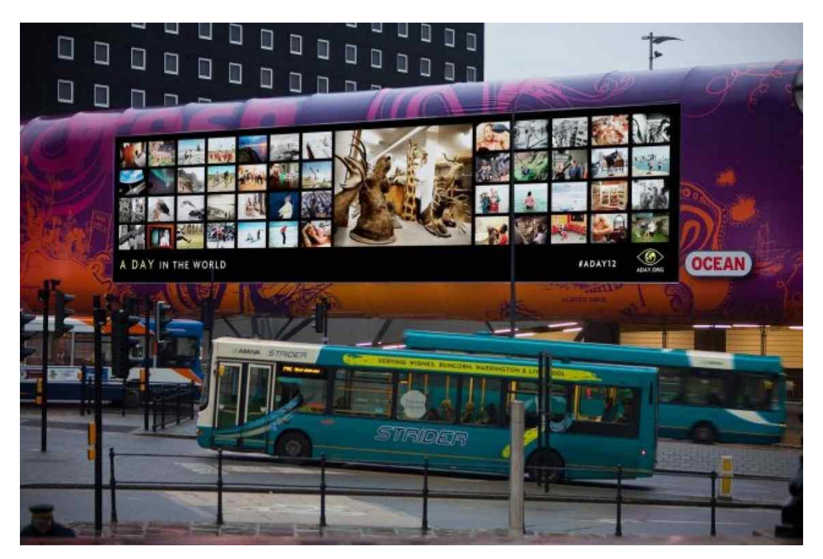
A Day in the World (2012) Exhibit view in Liverpool, 2012 Photo | 640 x 427 px

In my recent research (Pollen, 2012a; 2012b; 2013a; 2013b; 2016), I have been exploring current and historic photographic projects that feature a similar "catalogue aesthetic", and which similarly engage with huge quantities of images, but the use that is made of these volumes is for a different agenda. They employ a different language from the art projects cited, which tend to take a critical, if not pessimistic, position. Rather than applying the terminology of addiction, disease or natural disasters, these mass photographic projects aim to harness the communication potential of mass image-making and operate in a much more optimistic frame: the terms that are preferred are inclusion, participation, and unity. The range of these projects is broad and their underlying purposes can be variously historical, sociological, charitable, or commercial, but together they represent a clustering of efforts to gather people together to capitalise upon a critical mass of networked camera ownership.