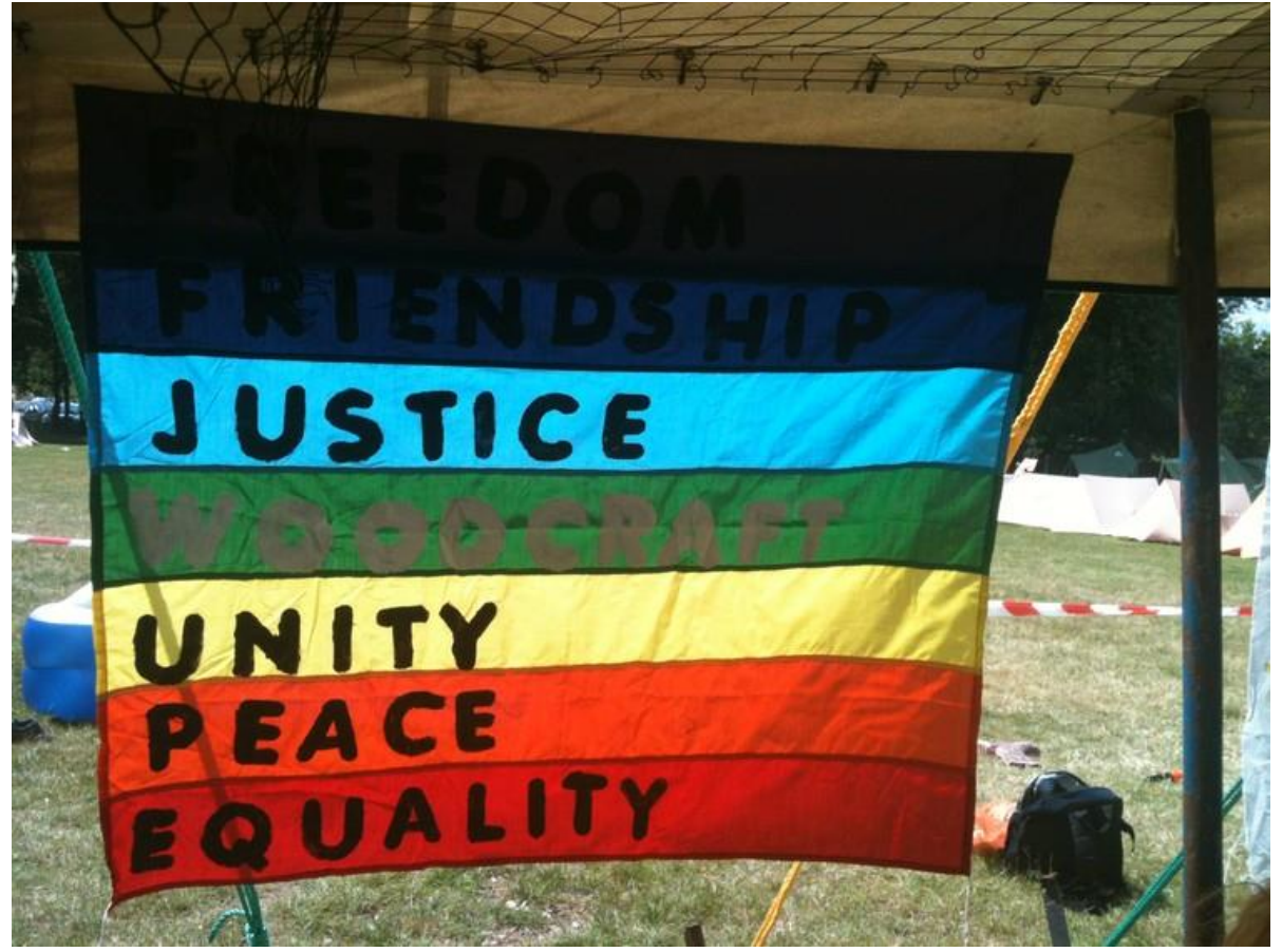
Rainbow woodcraft banner, Woodcraft Folk 'Back to Beginnings' camp, 2014.

Seton's ideas also spread across the Atlantic and were enthusiastically incorporated (without credit) into Baden-Powell's emerging <u>Boy Scouts</u>. Scouting was hugely popular from the start and thousands of groups were established by the start of World War I. But with many young scouts and scout leaders signing up to serve, those with pacifist leanings frequently came to reappraise the movement they once held dear.