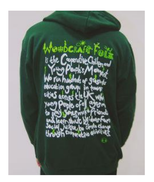
Woodcraft Folk 'Woody Hoody', 2015.

Dispute in the Kibbo Kift ranks about Hargrave's method of organisation led to the formation of a breakaway group, the Woodcraft Folk, in 1925. Here a more democratic approach was taken to building a new world order. The cultural revolution was one in which all members could decide the rules and where children were considered as capable of self-government as adults. Perhaps unsurprisingly, Woodcraft Folk's education for social change is still in the pink of health, with around 15,000 adult and child members. The group celebrated its 90th anniversary in 2015. Jeremy Corbyn cut the birthday cake – the socialist principles are still strong.