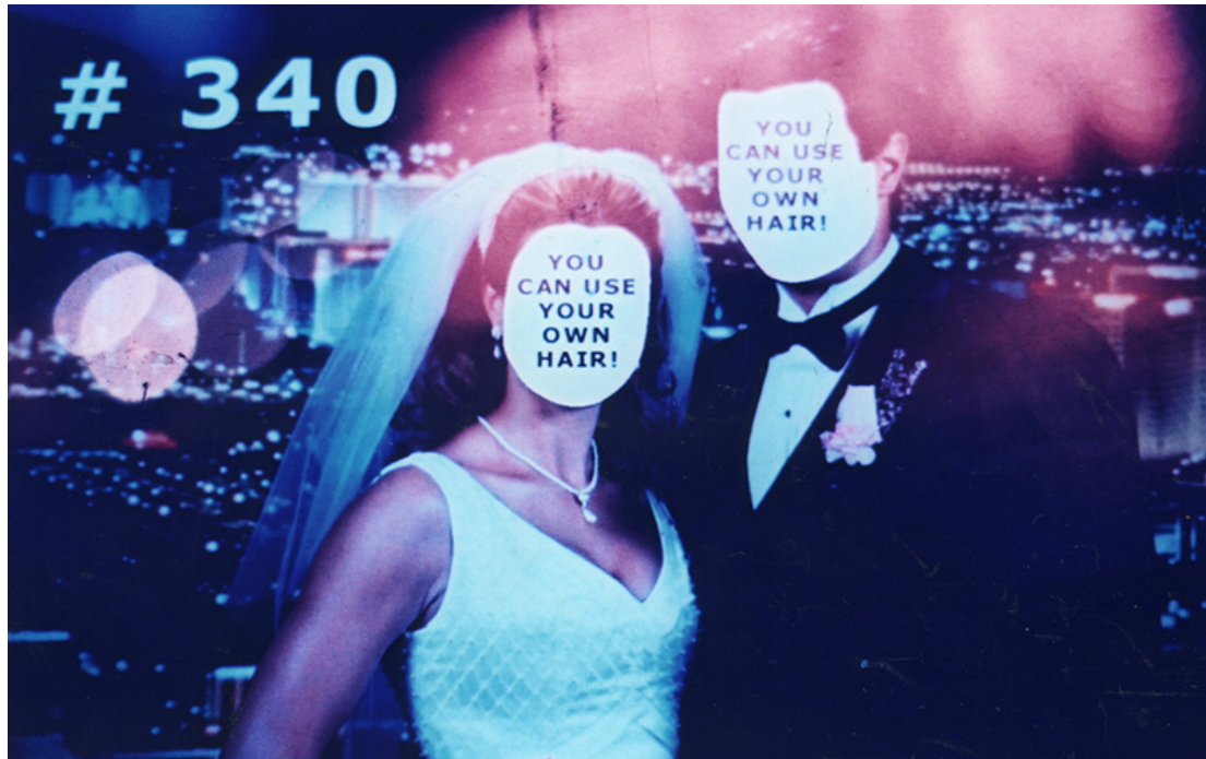
Figure 7: This broken mirror.

Perhaps consequently our rational, technological world is more populous with phantoms than ever. Each ghost exorcised by science precipitates a host of new phantoms rushing to supersede it. Paralysed in a frozen now, smothered by the massed murmurings of the past, stalked by the angry revenants of forgotten radicals and the awful twins of a future, that is at once inconceivable and yet inevitable, from avatars and chat-bots to bump maps and page curls, the digital world is populated with a host of Skeuomorphic phantoms clothed in dust scratches, the imperfections of lost surface patination and process noise, haunted by the loss of body that the Faustian pact of digital omnipresence entailed. Perversely, the spectral digital world is itself haunted by the ghosts of materiality. It does seem strange that the digital world which promised us limitless futures seems instead preoccupied with serving up the ever unfolding past wrapped in a perpetual present.