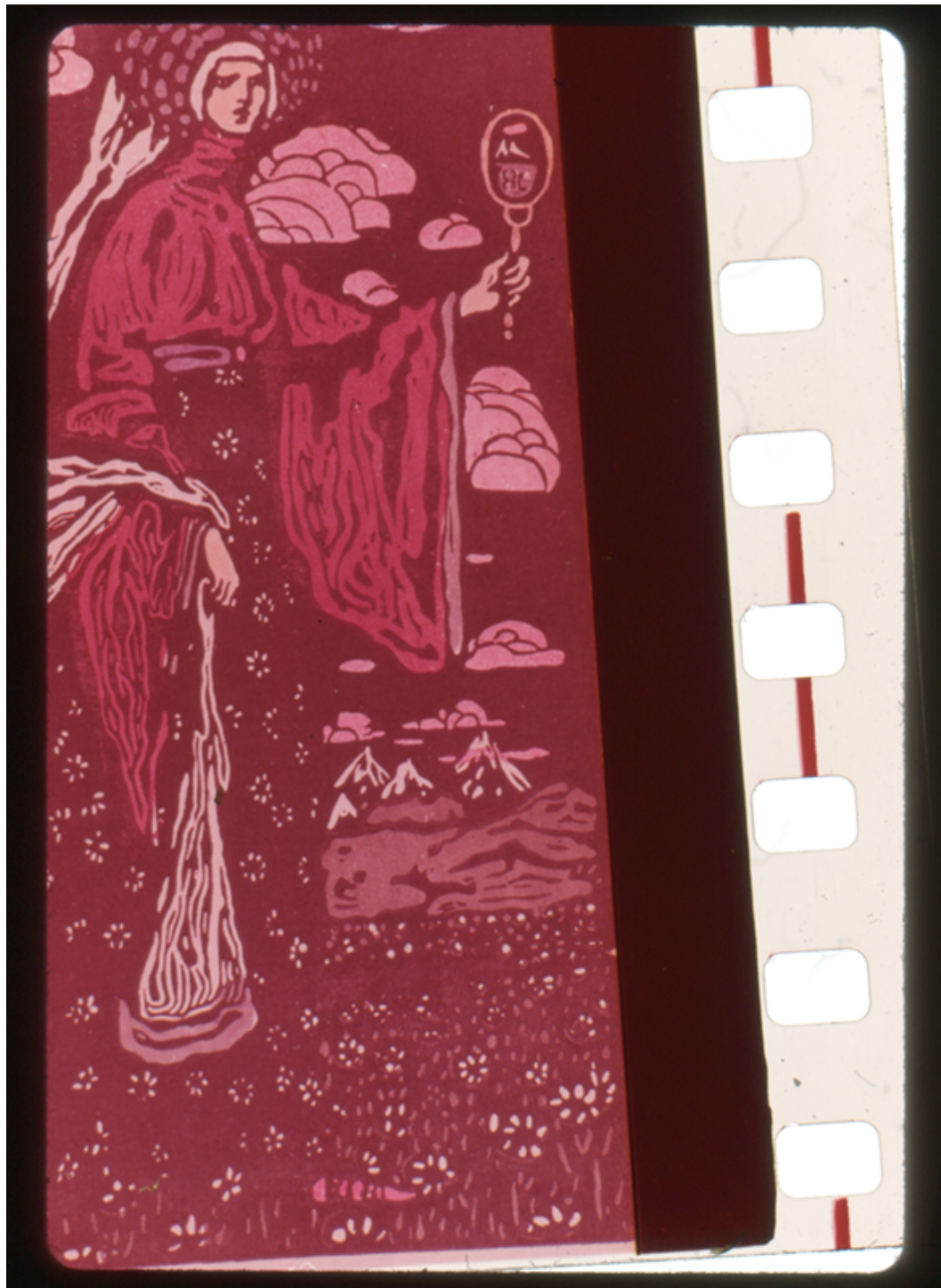
Figure 3: Hic svnt dracones