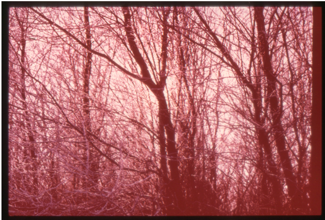
Figure 1: Sunken forests.

Traces of this were recently exposed by storm tides in the form of fossilized footprints, embedded into the shoreline were some of the oldest human remains found outside of continental Africa, then just as summarily erased. As this attests, the ever-shifting delineation of land and sea is perhaps much more fluid than we would like to believe, demonstrating the fragile, ephemeral nature of the human in respect of the sublime power of nature.