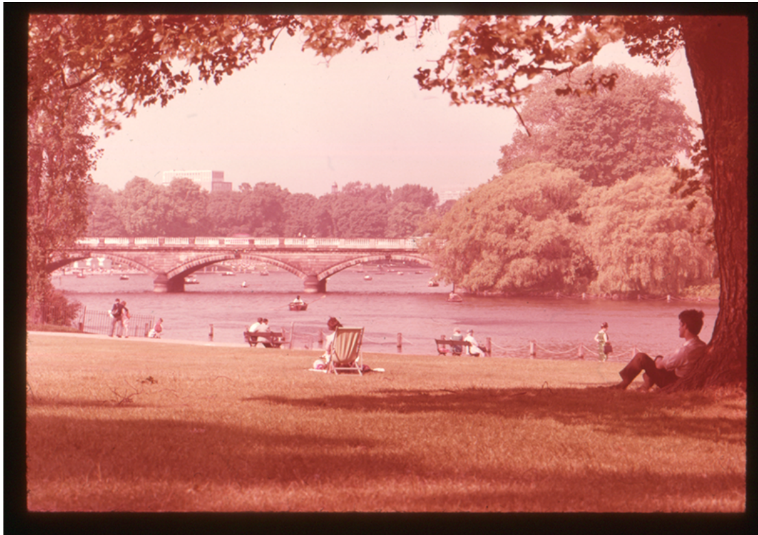
Figure 2: This lost region.

When the early trawl boats or ‘Doggers’ as they were known, first fished the Dogger Bank, it was common practice to break the large cakes of ‘moorlog’ found in the nets into pieces and discard the detritus in deeper water. Whilst a few of the blocks and some of the bones they contained were brought back to Yarmouth as curiosities, no reliable record seems to have been kept as to the exact details of the content or location of any of the finds.