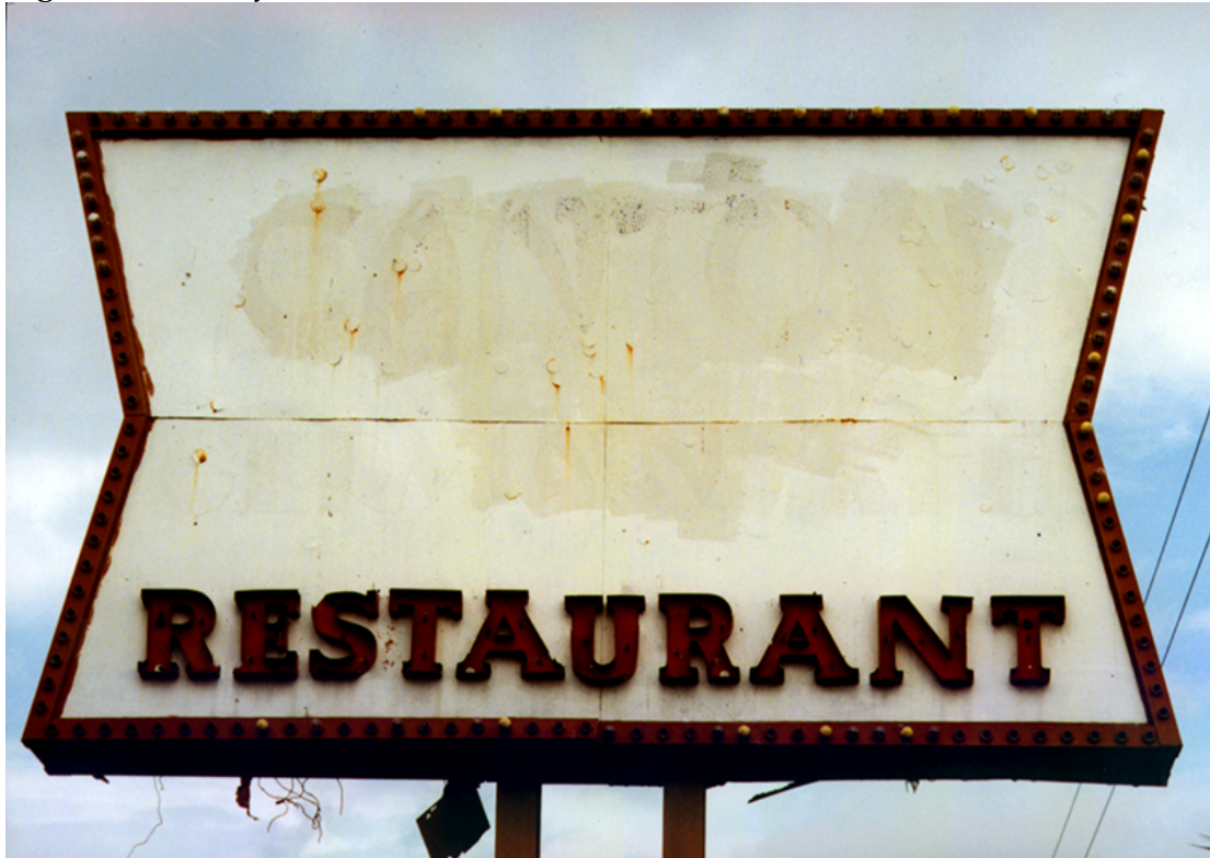
Figure 5: Vacancy.

Inside, the building is of two story's and contains three thousand rooms, of which half are underground, and the other half directly above them. I was taken through the rooms in the upper story, so what I shall say of them is from my own observation, but the underground ones I can speak of only from report, because the Egyptians in charge refused to let me see them, as they contain the tombs of the kings who built the labyrinth, and also the tombs of the sacred crocodiles.