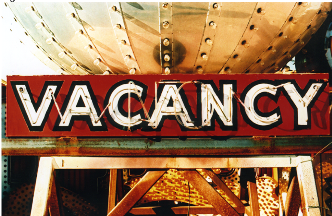
Figure 8: Lacunae.

Modern life has become an immense accumulation of ghosts. Everything that was once directly lived is now haunted by itself.