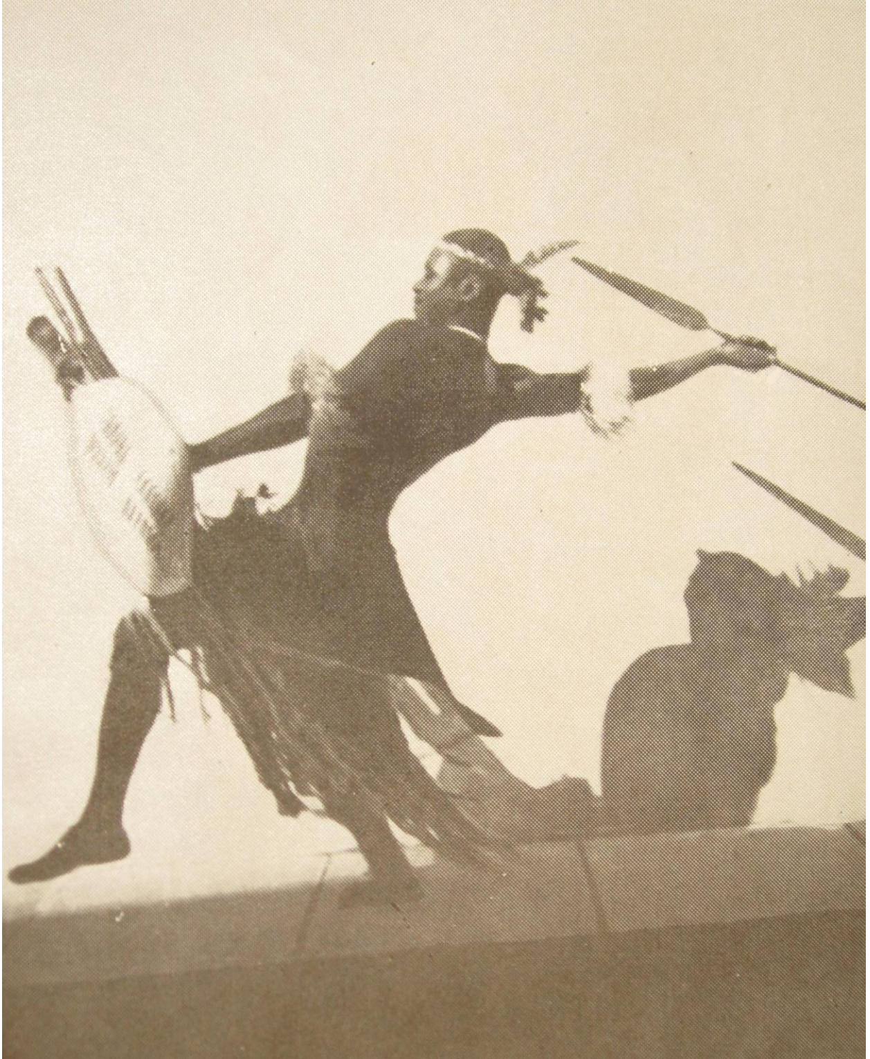
Zulu spear-throwing, Natal Tourism Bureau brochure, ca. 1930s