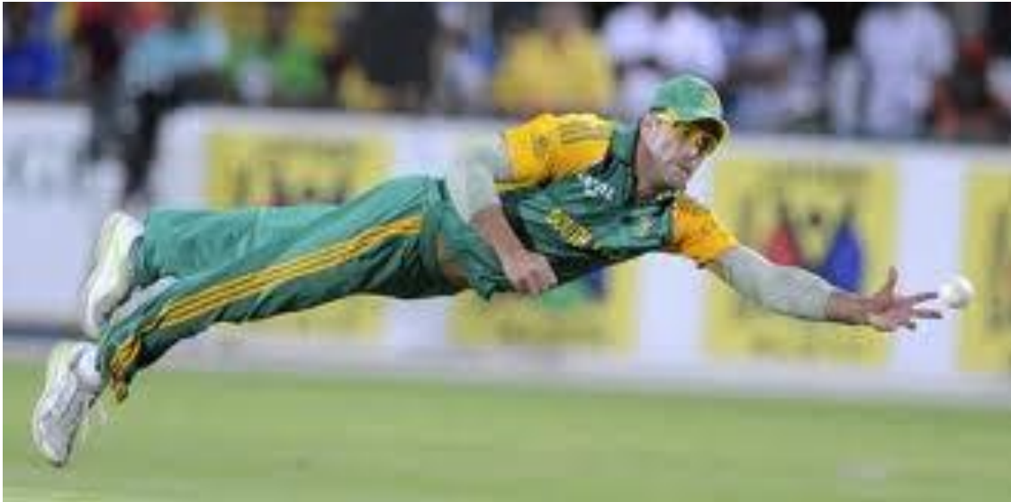
Protea Jonty Rhodes making a stabbing stop (above); Orlando Pirates [goalie name] making a stabbing stop (below)

stood out in the opening chapter of post-apartheid sport. He was an athlete hailed throughout the British Commonwealth as the white man who personified the Zulu warrior.