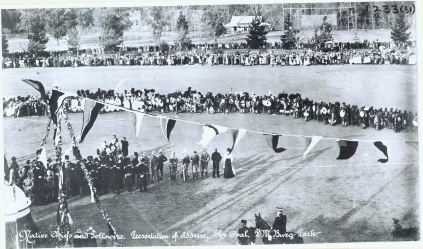
Native Chiefs and Followers. Presentation of address. The Oval, Pietermaritzburg.

C 1233.31 NATIVE CHIEFS AND FOLLOWERS AT THE OVAL, PIETERMARITZBURG