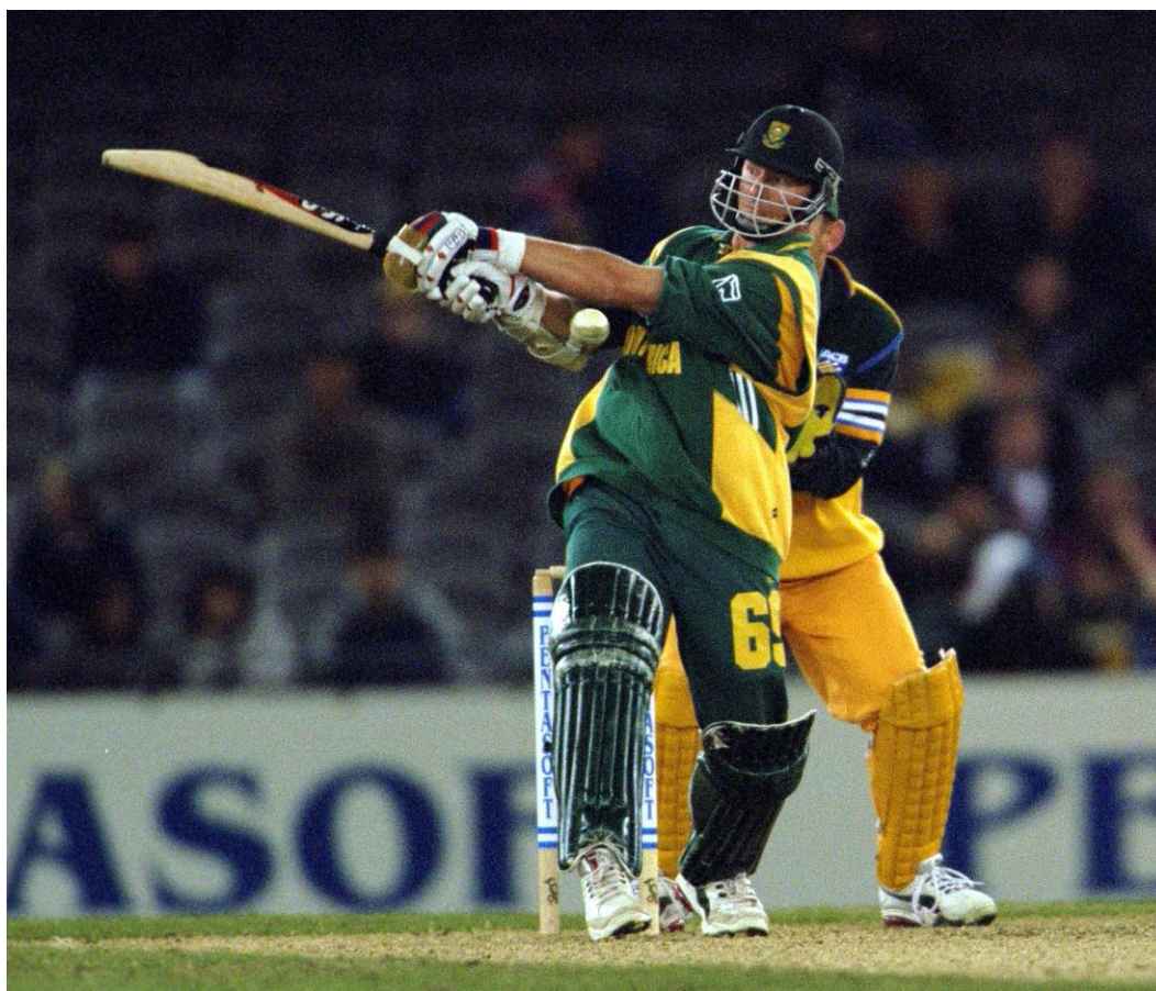
Lance “Zulu” Klusener

one-day international matches (ODI). His strike rate was nearly one run per ball. This percentage is among the best ever recorded; it ranks higher than his Test average (32.86) by nearly nine runs per innings. With an aggressive swing suited for ODIs, Klusener became the “one-day wrecker.” While he could awe spectators with cover drives, his swat was something to behold. His sixes soared. Some crashed into the pavilion, heralded by the announcer’s praise, “Zulu clops one!” Klusener’s bowling was formidable too. His off-cutters could collapse the batting order. He took 192 one-day wickets and 80 wickets in 49 Tests, with a best of 8 for 64.