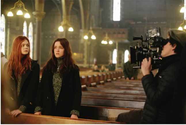
Figure 1. On the set of Ginger & Rosa : the digital assets include extensive ‘behind-the-scenes’ material as well as the film itself.