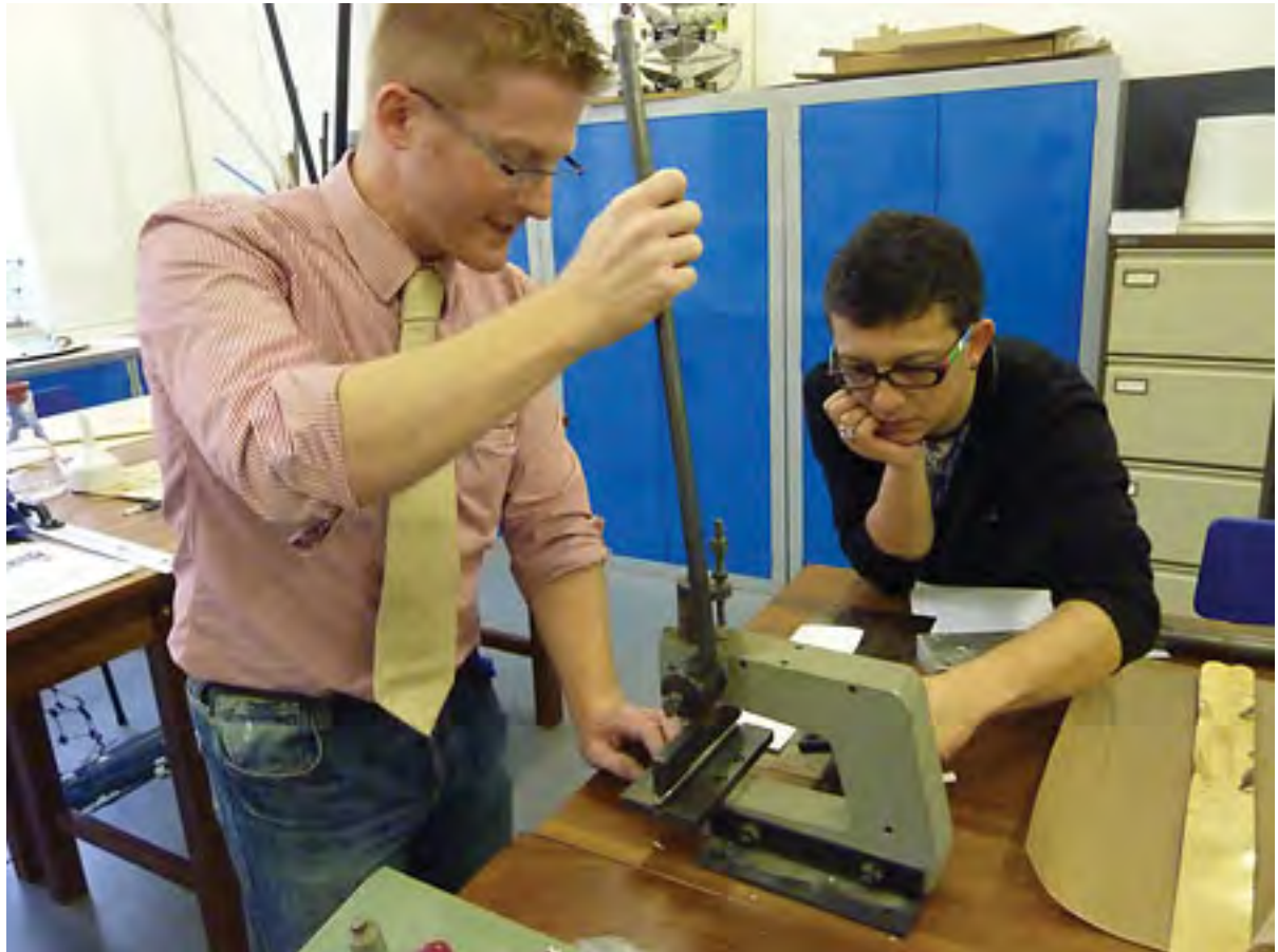
Figure 5. The scientist demonstrates the forming process to the research team.