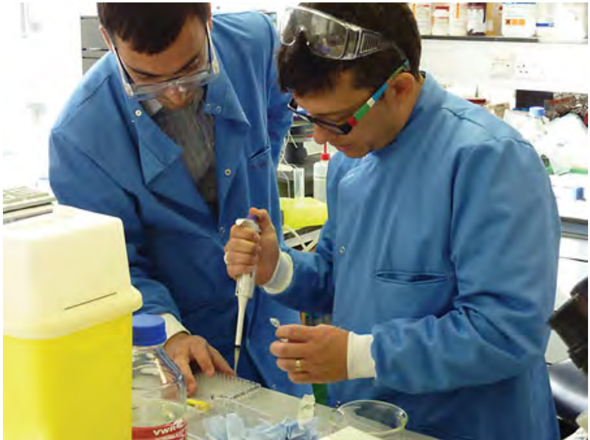
Figure 4. The designer performs an immuno assay during the observation day.

The data from this experiment was used to support a funding proposal for £150k to develop the idea further, including a £25k provision for marketing and design. The scientific team was awarded the funding and sought out a professional design consultancy to provide assistance with the detailed design. The research team met with the external design consultants to hand over the project.