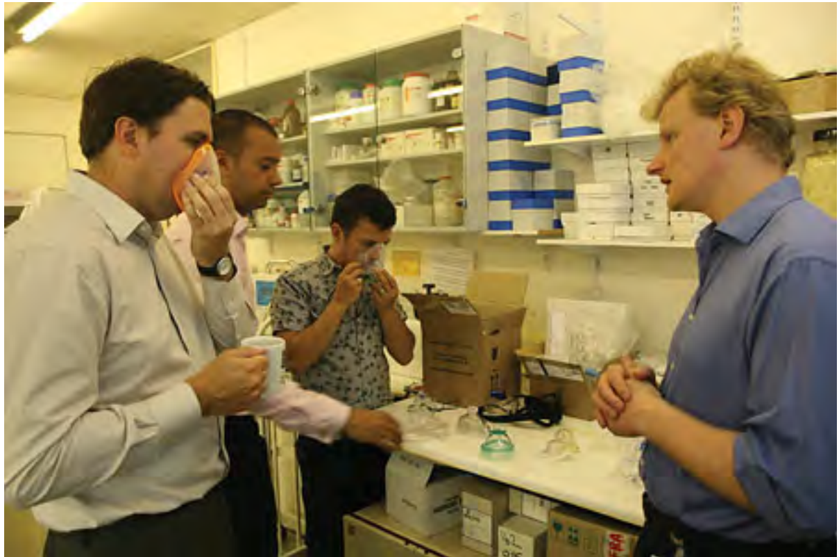
Figure 3. The anesthetist briefs the research team.