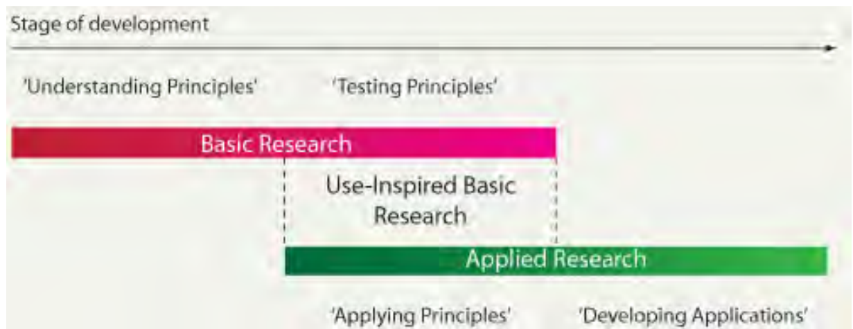
Figure 1. Model of scientific research (modified Stokes model 1997).

Based on these views, we developed a model of scientific research to position scientists’ work in terms of the stage of development and motivation. The model shown in figure 1 shares Stokes’s motivations for scientific research and anticipates definable stages of development similar to TRLs.