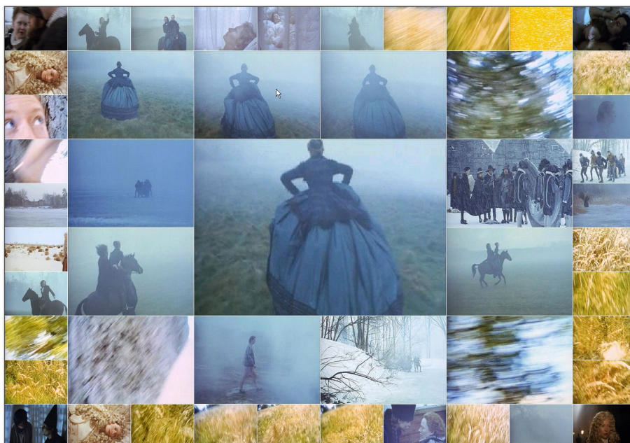
Figure 6: The visual browser (2009): Visual browser representing semantically coherent content from the SP-ARK archive