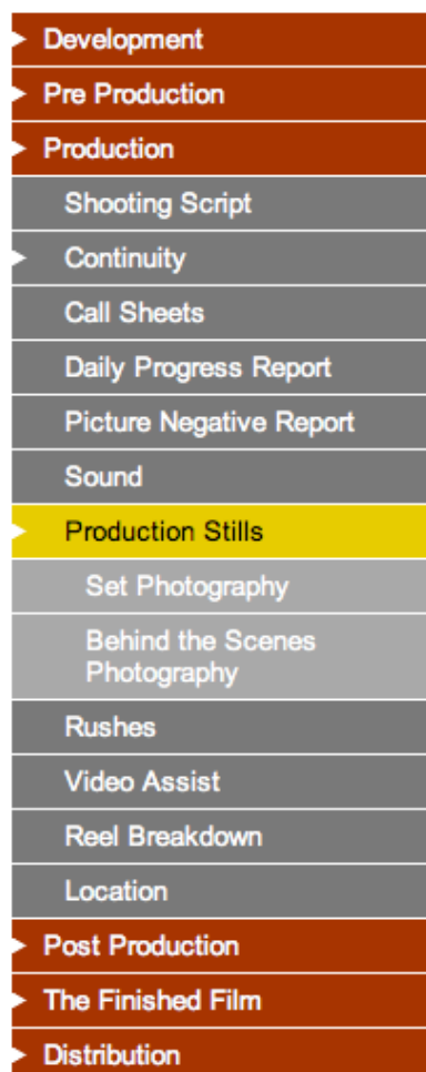
Figure 2: Navigation by production process taxonomy

The current iteration of SP-ARK has deployed standard web development and is built in PHP. It is a bespoke development (as it is not based on any other technology) and uses MySQL database. The descriptive information (texts, tags, asset descriptions) is all held in the MySQL database and the assets are handled as 'flat files'. User information (name, institution, email address – which are generated when a user requests a login to the site), and user pathways are also stored in the database. The site supports multiple levels of browsing and searching, which are all accessible without a login to the site. (The login enables users to create pathways and to message other users.)