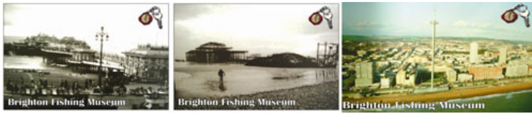
Figure 3: Three of the five 'Time Keys' required to free Lucy show the West Pier in 1916, 2006, and an artists impression of the future 'i360' on the same site.

Visitors to the museum are asked to help Lucy by gathering information found in the museum to provide time keys to enable her journey. These keys are each associated with information found in the surrounding exhibition (see figure-3) and provide the key to move forward in time, each key in turn builds elements of the final game identifying how the West Pier has changed over time, and indeed how the site will be developed in the near future.