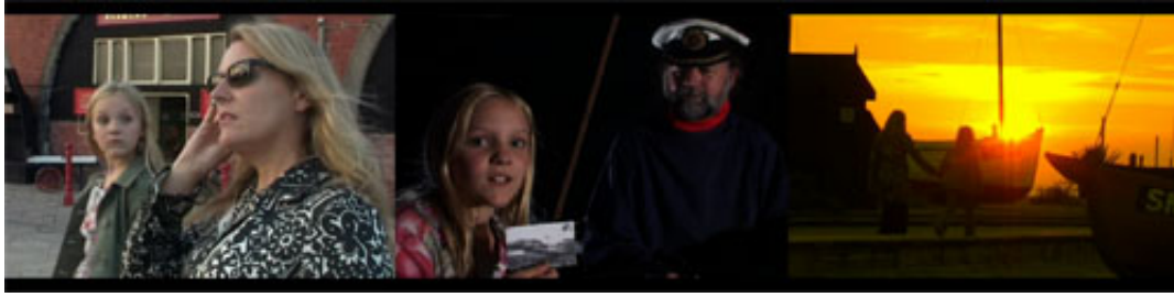
Figure 2: Screen shots from the exhibition. Lucy and Mum exit museum, Lucy and Fisherman with a time key, finale.

A story to appeal to this age group was devised involving a peer group character. A young girl (Lucy) walking on the seafront with her mother goes into the museum alone. Once inside she meets a friendly fisherman who tells her that she has been caught in a time warp and has traveled back two hundred years. She will need to travel forwards through time to get back to the present day (see figure-2).