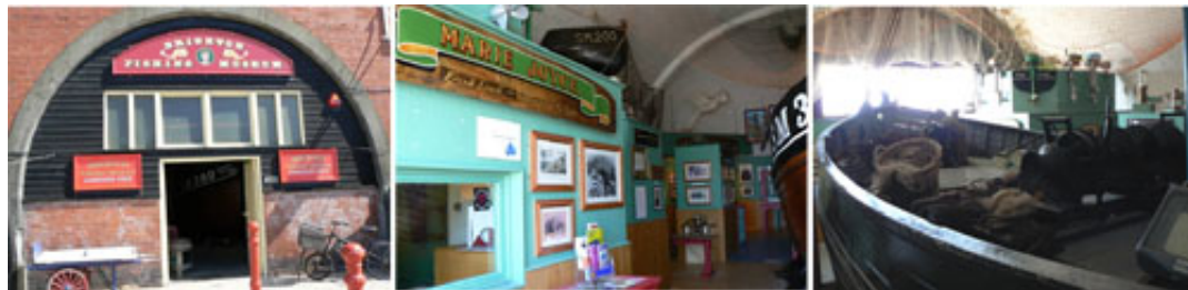
Figure 1: Brighton Fishing Museum, entrance and the deck of the 'Sussex Maid'

The University has connections with the Brighton Fishing Museum and it was considered to be an ideal venue for the project. Open year round, the unmanned, free to access museum draws in hundreds of thousands of visitors a year from the millions of people passing on the seafront. As shown in figure-1, the collection includes a 32-foot-long fishing boat 'Sussex Maid', prints, photographs and memorabilia of Brighton seafront life from the 19 th and 20 th centuries. It is run by volunteers from the 'Fishing Quarter' businesses and supported by the University of Brighton and Brighton and Hove Council.