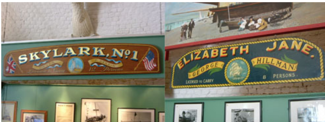
Figure 4: Boat name boards

The games used in the BBC Egypt InStEP project had been devised to be predominantly visual; for example, finding a location on a map or identifying and sorting images and iconography. For the Fishing Museum, students devised games requiring visitors to find the year of a memorable event, a location, a person's name, and to sort images of a local scene through one hundred years of change.