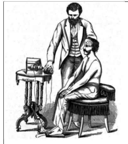
Fig. 2: General faradization. From J. Althaus, 'A Treatise on Medical Electricity' London: Longman; 1873.

especially in the field of psychiatry. However, the galvanic current continued to be used for the treatment of skeletal muscle disorders and peripheral pains.