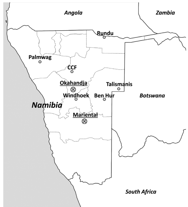
Figure 1. Screening for arenaviruses in Namibia. Trapping locations (named according to the nearest urban settlement) of small mammals. Sites where samples positive for new arenaviruses were found are marked by a crossed circle and underlined locality names. Geographic positioning system coordinates of the trapping sites: Ben Hur, 22^{\circ}87.26'S , 19^{\circ}21.10'E ; Cheetah Conservation Fund (CCF), 16^{\circ}39.0'E , 20^{\circ}28.12'S ; Mariental, 24^{\circ}62.08'S , 17^{\circ}95.93'E ; Okahandja, (21^{\circ}98.33'S , 16^{\circ}91.32'E) ; Palmwag, 19^{\circ}53.23'S , 13^{\circ}56.35'E ; Rundu, 17^{\circ}56.645'S , 20^{\circ}05.109'E ; Talismanis, 21^{\circ}84.30'S , 20^{\circ}73.91'E ; Windhoek, 22^{\circ}49.93'S , 17^{\circ}34.76'E .

During 2010–2012, animal trapping was performed in 8 areas in central and northern Namibia (Figure 1), and samples from 812 rodents and shrews were obtained (Table 1). The animals were dissected in the field and stored individually in a field freezer at -20^{\circ}\text{C} and later at -80^{\circ}\text{C} . For primary arenavirus screening, lung sections of all animals were homogenized, and RNA was extracted and reversely transcribed by using random hexamer primers. Screening was performed by arenavirus genus-specific reverse transcription PCR (RT-PCR) (10) to detect the L genomic segment. From samples testing positive by