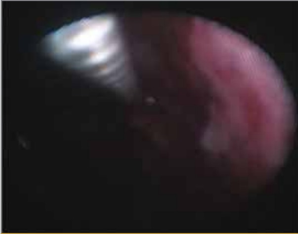
FIGURE 1 and accompanying online video: Intrapericardial view during percutaneous pericardioscopy with targeted epicardial biopsy. Biopsy forceps visible at 11 o'clock.