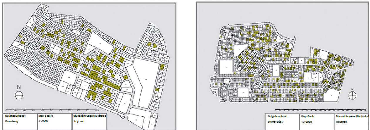
Fig. 2. Student housing distribution in Brandwag and Universitas