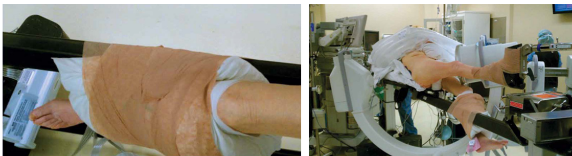
Figure 3 Well leg positioning on a fracture table: using a pillow sling.

This cut-off value was correlated by Meyer et al, who observed pathological delta values (between 4.1 and 23.7 depending on the compartment) when a classical support was used. 18 However, the delta value was shown to increase (between 26 and 35.1 mmHg) when the leg was supported at the ankle and the knee, leaving the calf unsupported.