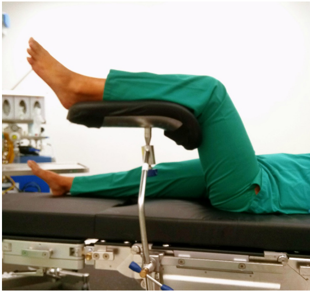
Figure 2 Göpel type support, example of which was used for our cases photography taken by the authors in the Operation room with authorization of the heads of department and the institution.

decreases the perfusion pressure as described by Meyer et al, who carried out dynamic pressure measurement of pressures in each compartment of the leg in healthy subjects when lying flat, compared to when positioned on a classical leg support. 18