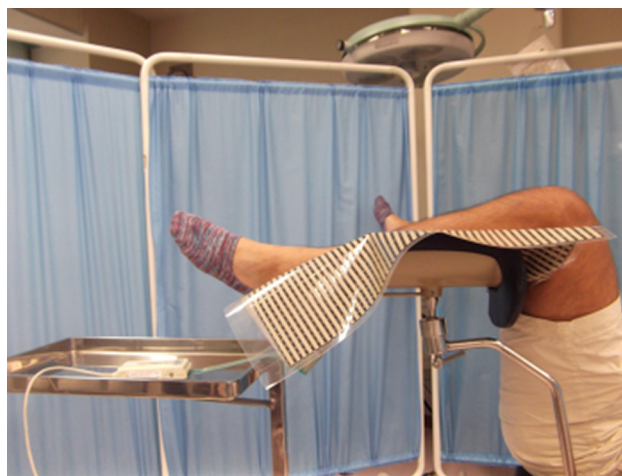
Figure 4 Male sex, height, weight, and body mass index can increase external pressure to calf region using knee-crutch-type leg holder system in lithotomy position. Note: Copyright ©2016. Dove Medical Press. Mizuno J, Takahashi T. Male sex, height, weight, and body mass index can increase external pressure to calf region using knee-crutch-type leg holder system in lithotomy position. Ther Clin Risk Manag. 2016;12:305–312.

Mizuno and Takahashi studied the relationship between the external pressure applied to the leg and certain physical characteristics. 21 The external pressure measurement was a noninvasive alternative to intramuscular pressure measurements. Twenty-one Japanese volunteers aged between 20 and 22 years and in good general health, with an average BMI of 21.4 kg/m 2 took part in the study. Diabetics and those with neuromotor problems were excluded. The team used a knee crutch-like holder which corresponds to the support used in our cases (Figure 4) on which they placed a pressure-sensitive measuring mat (BIG-MAT) which was