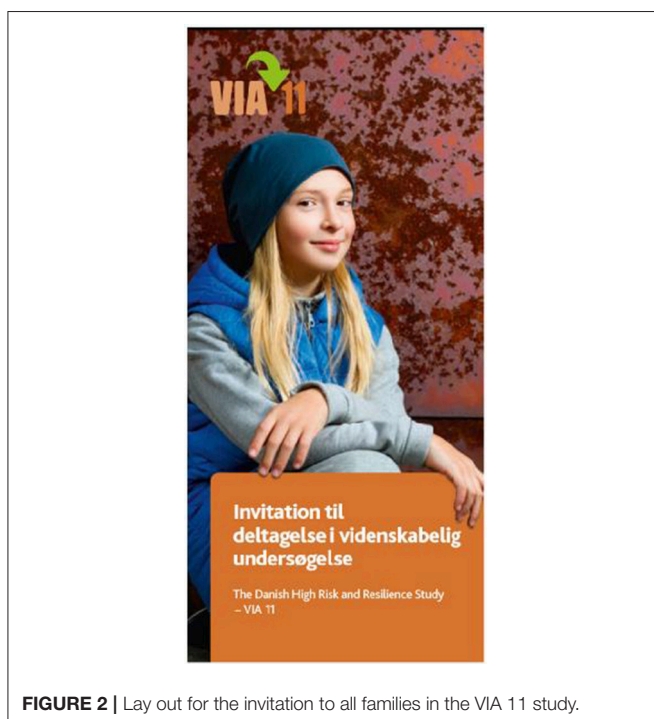
FIGURE 2 | Lay out for the invitation to all families in the VIA 11 study.

Results will be presented within the context of both cross sectional and longitudinal analyses, i.e., comparing the results from the first assessment at age seven with the results found at age 11. Cross sectional results will be reported in all new areas or instruments like MR scans, Virtual Reality setting, SENS motion data, and blood sample data, while developmental trajectories will be investigated for those measures that are repeated, i.e., most