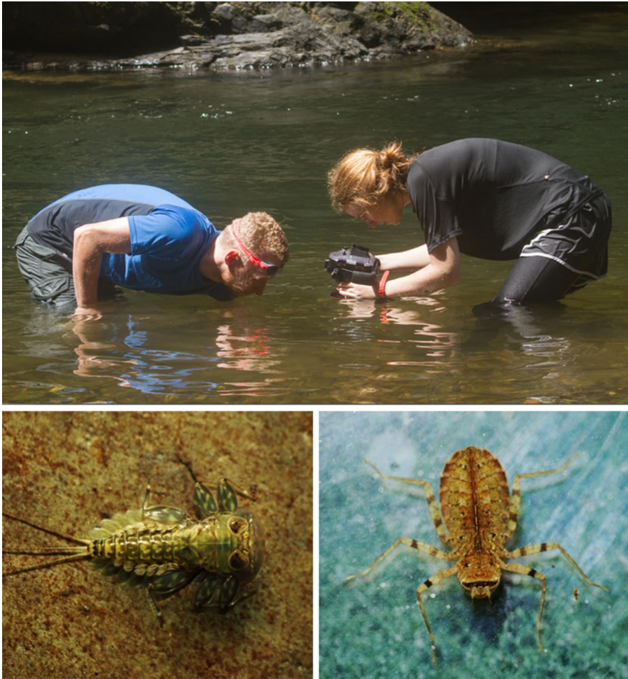
Fig. 1 Photography being conducted in Temburong National Park to capture characteristics of the resident fauna (top photo), Heptageniidae (flattened mayfly) (left photo) and a Macromia cydippe (Dragonfly) (right photo)