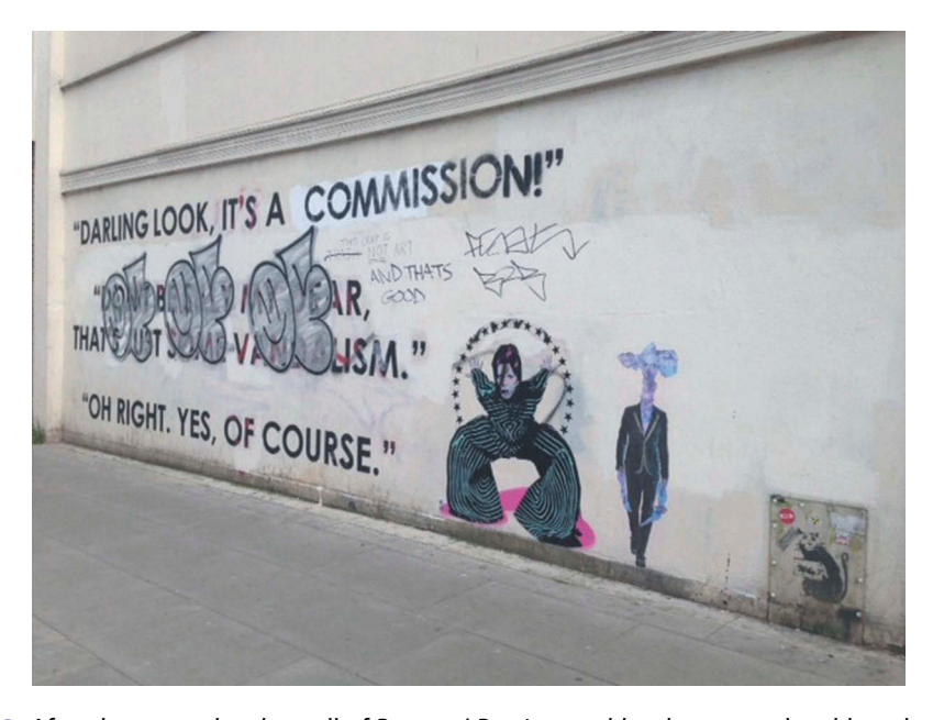
Figure 2. After three months, the wall of Pegasus' Bowie mural has been populated by other works. April 2016.