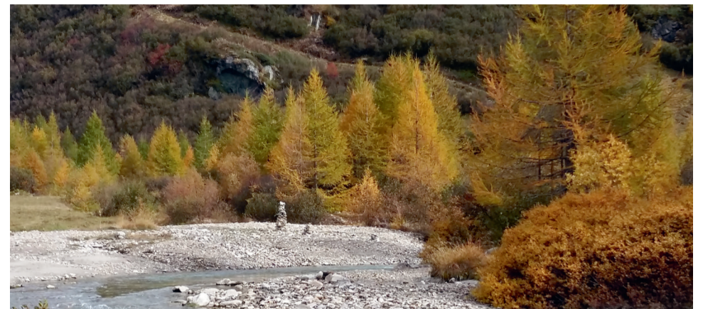
Fig. 1: European larch ( Larix decidua )