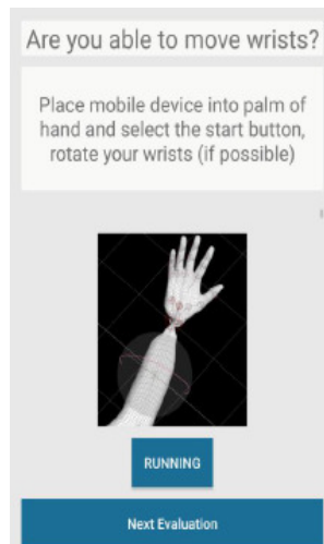
Figure 4: Capturing user's ability to move their wrists by utilising the significant motion sensor

captured utilises the step sensor to count the number of steps that the user can take in 40 seconds. The subsequent interfaces determine the user's ability to smile and blink, by utilising the RGB camera and faceDetector.Face Application Programming Interface (API) [11]. Speaking is assessed by asking the user to repeat a specific phrase and the Voice-to-Text translator determines whether the speech is intelligible. The succeeding abilities to be assessed relate to the movement of the user's head, shoulders, elbows, wrists (shown in Figure 4), fingers (using touch gestures) and ankles, by utilising the accelerometer and gyroscope on the device. The user's ability to blow in and out is evaluated by instructing the user to blow into the microphone. The sound generated is processed by the Noise Threshold Sensor, with the threshold decibel (dB) level set to 50dB and 45dB for blowing in and out respectively (determined in previously conducted trials [26]). The final interface captures the abilities that cannot currently be detected, by built-in sensors through checkboxes. The data collected from the sensors and checkboxes is processed using the mappings defined in the Application's code that reflects the knowledge contained within the SmartAbility Framework.