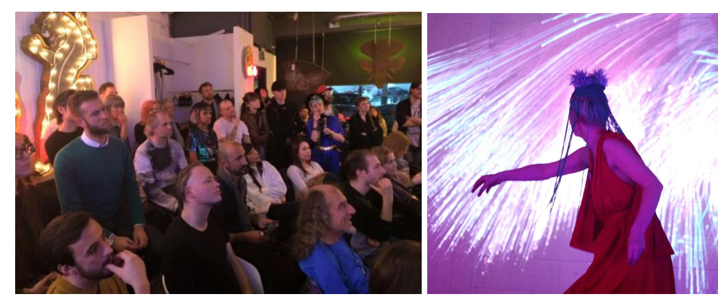
Images: Image from our past FLUX talk's event at Lights of Soho Gallery & Kimatica Studio installation at Art in Flux.

Keywords at least three: Electronic Arts - Media Arts - Contemporary Media Art Practice - Light Art