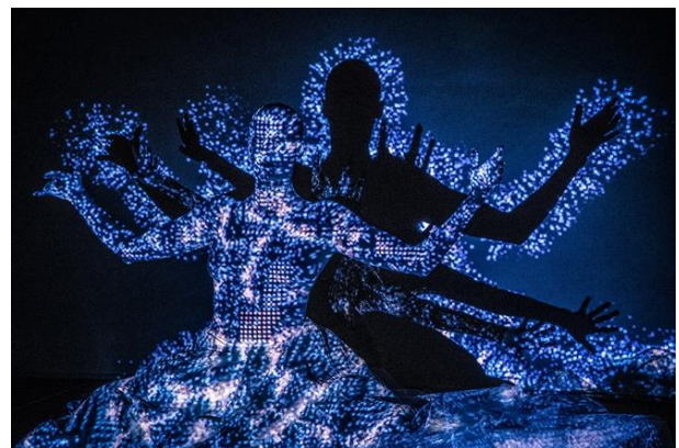
Figure 3: Kimatica: Transcendence (2017).