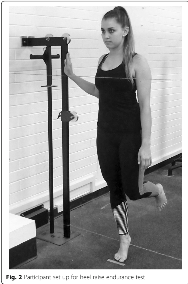
Fig. 2 Participant set up for heel raise endurance test

using a choice of electronic or paper monthly diary entries. They will record: training distance (km), training type (long run, easy run, tempo/race pace run, interval/speed run, walk, strength training, sports match), training duration (minutes), races completed, race distance, race type (trail, road, triathlon, Iron Man), changes in footwear, illness, injuries and subsequent time off running. An injury will be defined as a musculoskeletal impairment for which a participant takes more than seven days off weight bearing activity or seeks treatment from a health professional. For any injury, participants will be required to complete a Sports Medicine Australia Sports Injury Tracker Report [53]. Data will be collated monthly and followed up if not returned. In the case of any injury, participants will be required to immediately notify the chief investigator, who will clarify details of the injury. Upon suspicion of MTSS, participants will be required to attend a follow up session at the Biomechanics Research Laboratory to confirm a diagnosis of MTSS. MTSS will be defined as diffuse pain induced by exercise along the posteromedial tibial border that is non-inclusive of pain from ischaemic origin or stress fracture [2]. Participants, who develop lower limb injuries other than MTSS,