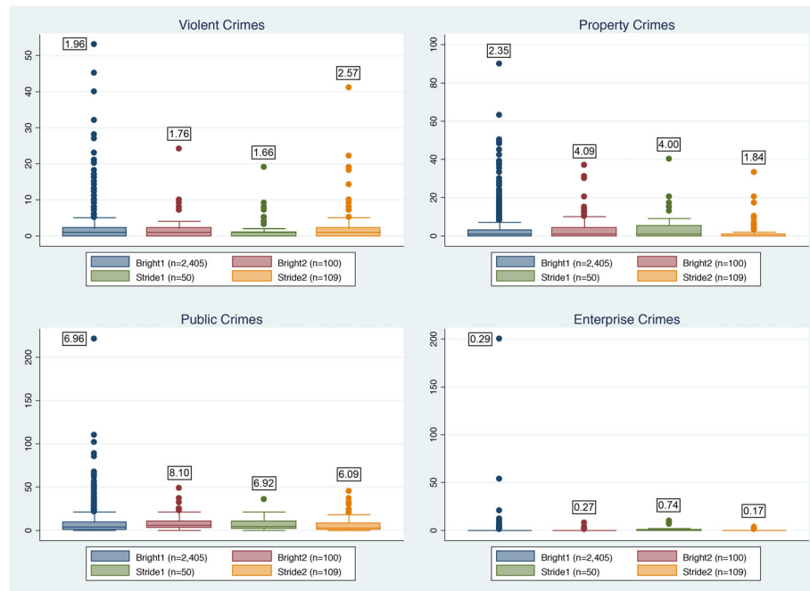
Fig. 1 Lifetime arrests, by crime category. Means reported in boxes above the bar graphs. Means are tested using a bootstrap-based nonparametric one-way ANOVA. Means not statistically different ( p < 0.5 ). BRIGHT 1 and 2 ask about arrests and charges separately. For this comparison, we assume a charge is equivalent to “arrested and charged.” The central box spans the first quartile to the third quartile; the whiskers above and below the box show 1.5 interquartile-range (IQR) from the corresponding quartile

because, on average, only 3% of respondents report committing any crimes. Figure 3 shows average offenses per 30 days, by crime category. Most individuals report committing public order crimes (> 50%). The most commonly reported offenses within this category were prostitution/pimping, larceny/shoplifting, and household