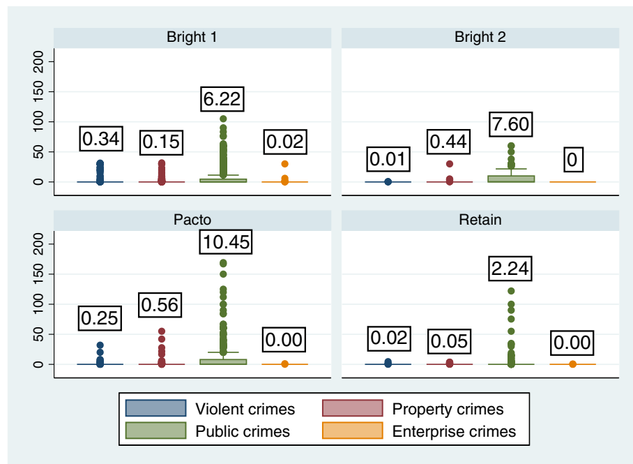
Fig. 3 Average number of offenses committed per 30 days by crime category. Means are displayed in boxes above bar graphs. BRIGHT 1 and 2 ask about crimes committed in past 90 days, and RETAIN and PACTo ask about crimes committed in past 6 months. These values were divided to represent past 30 days for comparisons. Means tested using a bootstrap-based nonparametric one-way ANOVA; means not statistically different ( p > 0.5 ). The central box spans the first quartile to the third quartile; the whiskers above and below the box show 1.5 interquartile-range (IQR) from the corresponding quartile

rarely reported in these studies, had an average 30-day cost ranging from $0 (BRIGHT 2 and PACTo) to $80 (BRIGHT 1).