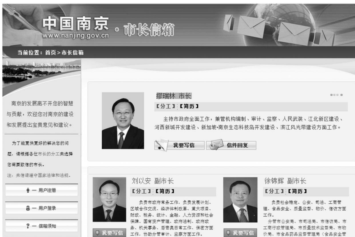
Figure 1. The Mayor's Mailbox constituency service front page for Nanjing, China, a prefecture of approximately eight million people in eastern China. The button next to the photo of Mayor Miao Ruilin says "I want to write a letter."

provided useful information about the policy in question, an example of which is provided in the following section.