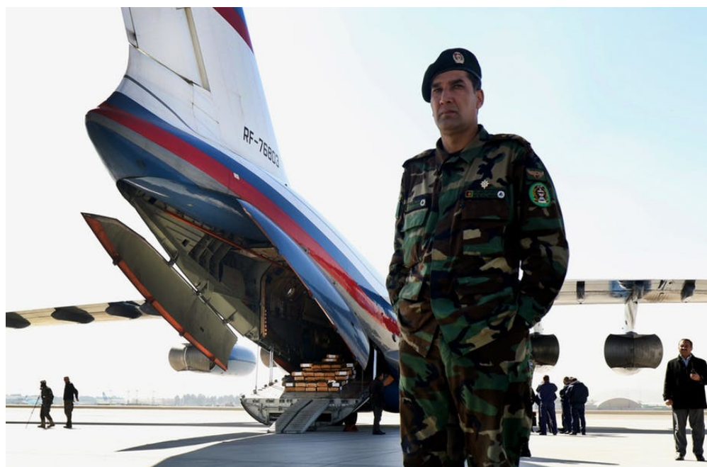
A Russian plane delivers 10,000 AK-47 rifles to the Afghan National Security Forces.

Senior Lecturer, Politics, University of Exeter