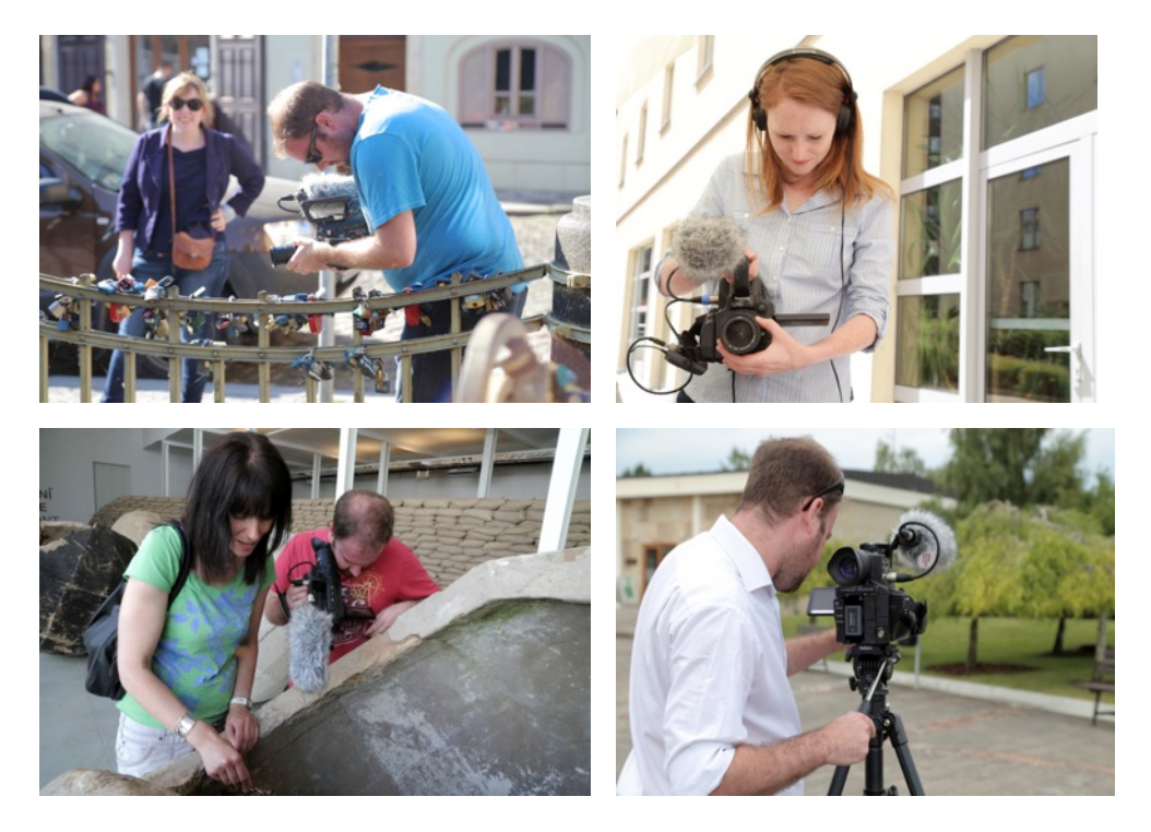
(Filming in Prague and Lidice)