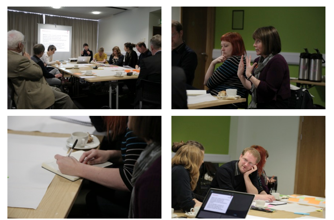
(The Working Group discussing emerging findings at the Mitchell Arts Centre in May 2014)

Again, participants brought a wide range of experiences and backgrounds to the group, which prompted lively debate. The meetings were very helpful in terms of challenging some of the research team's assumptions, and offering alternative interpretations of the emerging findings. It also enabled a strong focus on understanding the types of resources that would actually be useful to people in their practice. For example, we discussed the idea of creating some kind of 'toolkit'. The overall consensus, however, was that this would be of limited value, and that the main resource that people found helpful was that of talking to other people, including other artists. This led directly to us commissioning additional work from the film makers to create a series of short films in which artists share their own practices in terms of considering empathy, compassion and understanding at each stage of the project cycle. In addition, the working group discussions were helpful in shaping the planning of the research visit to Lidice. An account of the research visit, which involved members of the working group as well as the research team, is given in the next section of the report.