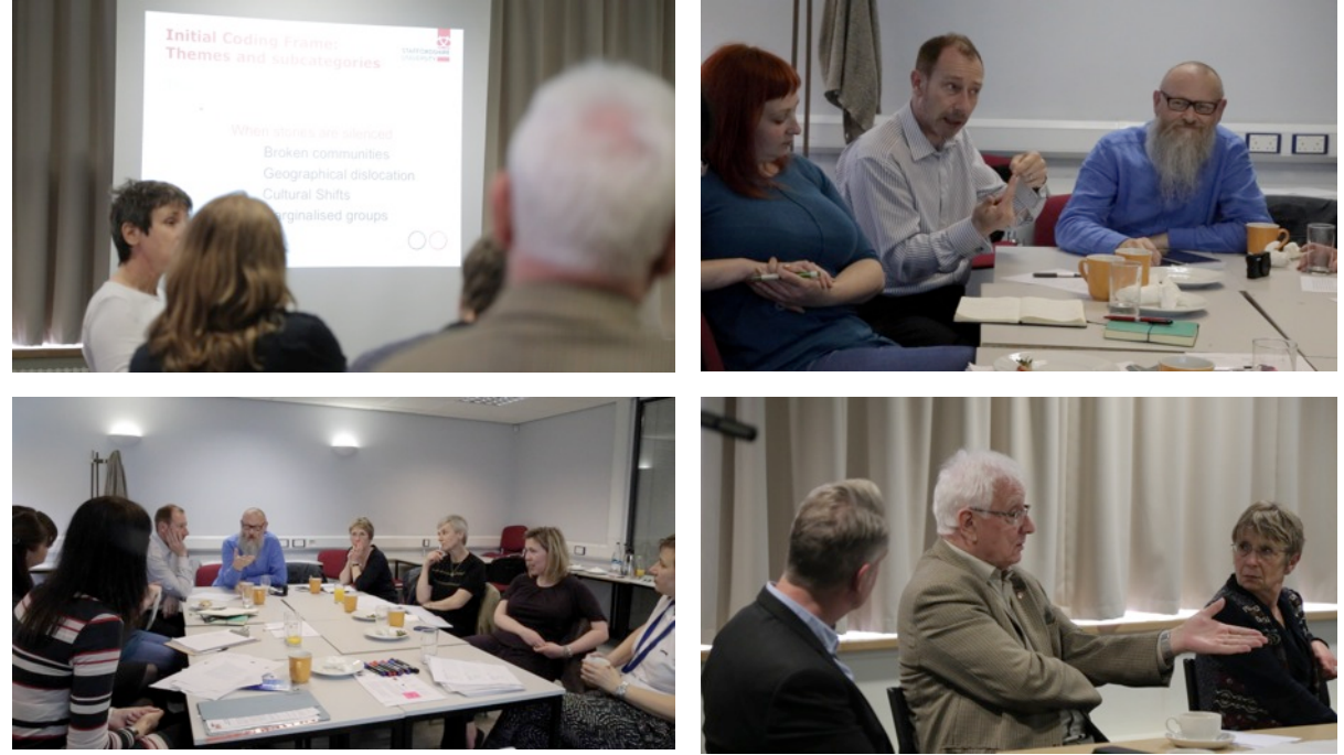
(Working Group discussions)

disciplinary nature of the research team, as each researcher was naturally influenced in their analysis by their own background in terms of discipline and practice.