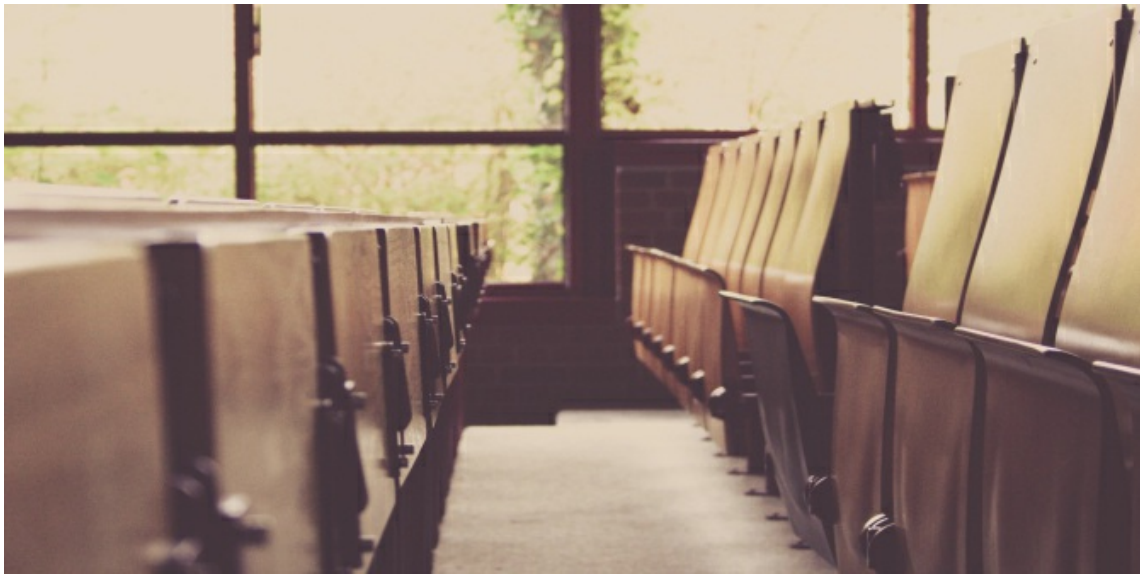
Image credit: lecture hall / university , by Markus Spiske. This work is licensed under a CC BY 2.0 license.

The second chapter offers an illustration of how to do history over the long duration by tracing writing instruction, the oldest education practice, over 4,000 years of history. The history of education starts with the history of writing, and these two have been almost indistinguishable for long stretches of time. Text is the “most important for the culture of education” (16) because education has writing at its centre, understood as a system of inscription. Passing on this system requires a lot of instruction and effort, because our brains are not naturally wired to learn how to write or to use inscriptions. Friesen reconstructs the history of education as the history of the effort to rewire the brain into learning to write and to use writing for thinking. The chapter compares ancient techniques of writing from Sumer, Jewish education and the Chinese imperial age with current writing practices. Friesen shows that writing instruction historically was standardised through repetitive exercises and dictation. Learning to write was about acquiring patterns of behaviour in designated spaces, separating pupils from the productive world and allocating for this a designated time: the time of the school. The similarity with current learning practices is striking. Friesen shows that children today “still learn writing through a set of steps with carefully sequenced arrangements of instructional methods, materials and content” (29).