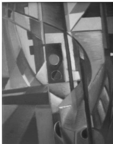
4. Concetto Maugeri, Filobus no 1 , 1950, oil on canvas, 59 x 66 cm., Maria Grazia Maugeri collection, Arzignano.

Turcato, in turn, attempted to synthesise a «cubistic» attention to form with the communist commitment to a «realist» subject-matter. The result can be seen in works such as the 1949-50 series of Rovine di Varsavia , produced after a trip to Poland in 1948. The paintings sought a suitably modernised «abstracted» representation of the ruined walls of Warsaw buildings after the Nazi repression of the August 1944 uprising. Although the events told are immediately recognisable, they are treated as a series of visual impressions deprived of the emotiveness that the subject-matter could convey in the immediate post-war period. There is no narrative, but