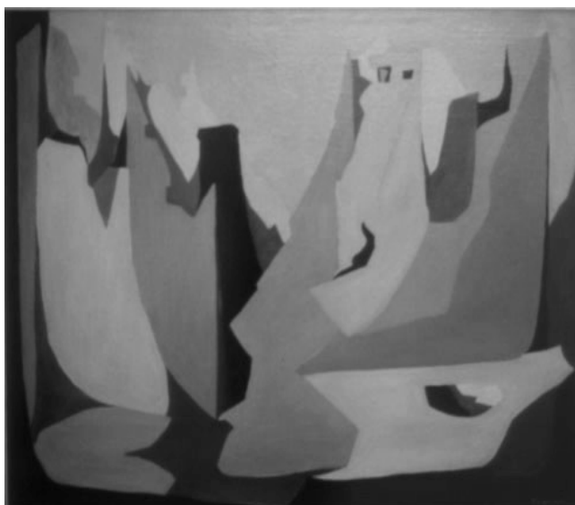
5. Giulio Turcato, Rovine di Varsavia (Ruins of Warsaw) , 1948, oil on canvas, 48 x 71 cm., Galleria Comunale d'Arte Moderna, Rome.

impressions of colour and rhythm. Thus, in this case, the relationship that Turcato establishes between content and the means of expression prevents the works from becoming mere decoration but they cannot become instrumental to any specific political programme either. They do not provoke any direct sympathetic response but rather they invite the viewer to reflect upon the way in which such subjects were commonly represented. ( Illustration 5 )