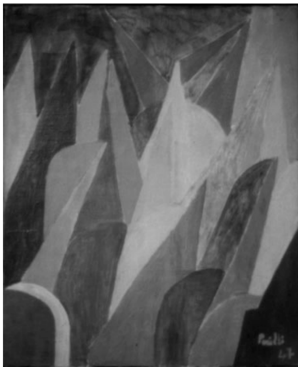
2. Achille Perilli, Praga (Prague) , 1947, oil on canvas, 57 x 47 cm., Galleria Comunale d'Arte Moderna, Rome.

Forma 1's reflection upon the historic limits of human perception of being-in-the-world postulated that society and the self are constructed and controlled by systems of representations. The artists conceived their commitment as a liberating diagnosis and revelation of the manner in which these representational systems operated. In this way, they thought, Marxism and modernism would become harmonised. Accordingly, artists did not transmit edifying examples of existence through picturing. Instead, by means of art's autonomy, art acted upon the viewers' psyche, questioning their schemes of perception and predisposing them to a more lucid experience.