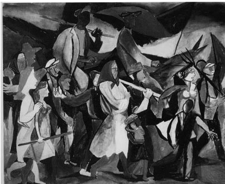
1. Renato Guttuso, Occupazione delle terre incolte (Marsigliese contadina) , 1947, watercolour, tempera, ink and pencil on paper, 70 x 90 cm., Galleria Nuovo Segno, Forlì.

style, but they were committed to democratising art and to working for a mass public. This audience, however, was perceived to be politically progressive but also aesthetically conservative and in need of some preliminary artistic education. Artists knew that they could only reach this audience by both taking art down to their intellectual level and counting on the Italian Communist Party, since this was the only post-war party with a consolidated mass organisation and a programme which catered for both cultural and social renewal. If politicians had always needed artists to illustrate their programmes, it was artists now who needed politicians in order to bring their intellectual dynamics to a conclusion.