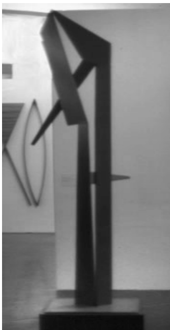
6. Pietro Consagra, Totem della liberazione , 1947, painted iron, 210 x 43 x 64 cm., artist's collection, Rome.

order to achieve «a higher dramatic effect» 21 and they are also arranged in enigmatic forms, organised according to an interplay of masses and voids. The arbitrary relationship between the Liberation, the precise geometric composition and the semantic inscrutability of the metallic construction puts forward a political statement: despite all expectations to the contrary, it is impossible to find a widely shared language capable of securing a reference to the contemporary social and political situation. ( Illustration 6 )