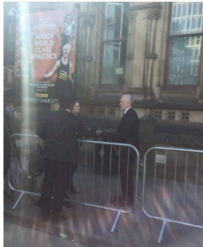
Figure 1: Jeremy Corbyn at Vigil. (Anon, 2017)

Gemma described how she came across it and, in a sense, reappropriated the image for her own means, further suggesting that the person who shared the image was the photographer: