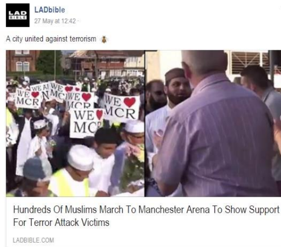
Figure 5: ‘A city united against terrorism’. (LADbible, 2017)

‘We heart MCR’, which is, obviously, shortened for Manchester, and some guy, however, like it’s not a funny subject, but he said, ‘I didn’t realise My Chemical [Romance] was so big in the...Muslim community’, which I just thought was absolutely hilarious. It’s good that he can actually have a bit of a laugh in, obviously, dark times.