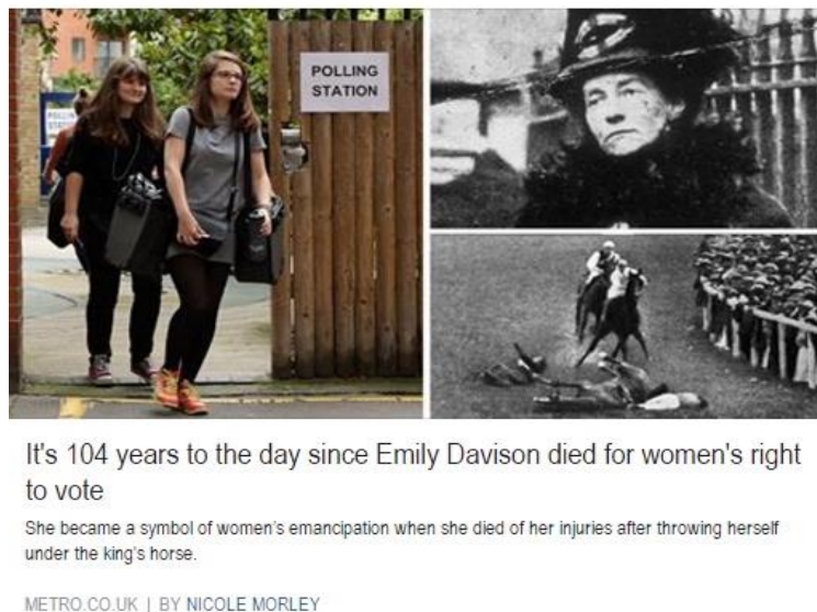
Figure 4: 'Emily Davison died for women's right to vote' (Morley, 2017)

I put this on vote day because I think it's annoying when people don't vote because they can't be bothered to vote – when people died so that women could vote...I also said that I was unsure of who to vote for because I didn't have a candidate for UKIP where we live, which is what I would have voted for if there had been a candidate...and then I just put what I thought and why I was confused this time and...I knew it would start a debate, but that's sort of what I wanted because I quite like to talk about it.