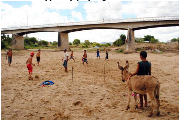
Figure 1. Pelada in Dois Riachos (Alagoas, Brazil). This is the exact context where the six-times FIFA award winning Brazilian player Marta learned to play football.

Pelada is usually played outdoors on irregular surfaces (e.g., streets, beaches, yards, makeshift grounds, courts, etc.) where the boundaries of the playing area are often marked or created impromptu, although it may also be played in demarcated venues such as soccer fields and futsal courts (see Figure 1). In addition, pelada is played under different rules and norms to other more formal versions of football such as futsal. For example, the number of players per team depends on the number of people present to play. Age and gender are not constraining factors, and players of all ages and both sexes typically play together.