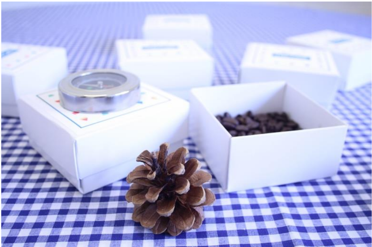
Figure 4: Life Café version of Exhibition in a Box

The workshops aimed to establish what good care looks like, tastes like, smells like, feels like and sounds like - to develop a complete sensory understanding of what people understand as good. The objects in this version of Exhibition in a Box therefore have elements of smell, sound, taste, and tactility and are visually stimulating. In the image below, you can see coffee beans, pinecones and a compass. The coffee beans represent sense of smell, daily routine and socializing. The pinecones represent nature, the outdoors and sewing seeds. The compass represents sense of direction, travel and navigation.