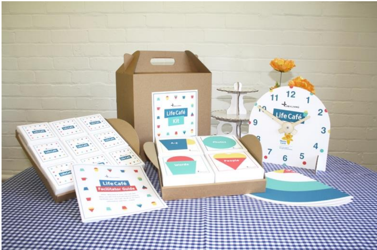
Figure 7: Life Café Kit

The Life Café branding incorporates symbols that represent the themes of conversation relationships, love, nature, food and drink. The colour scheme is based on the Marie Curie colours with a complementary pink to represent relationships and love.