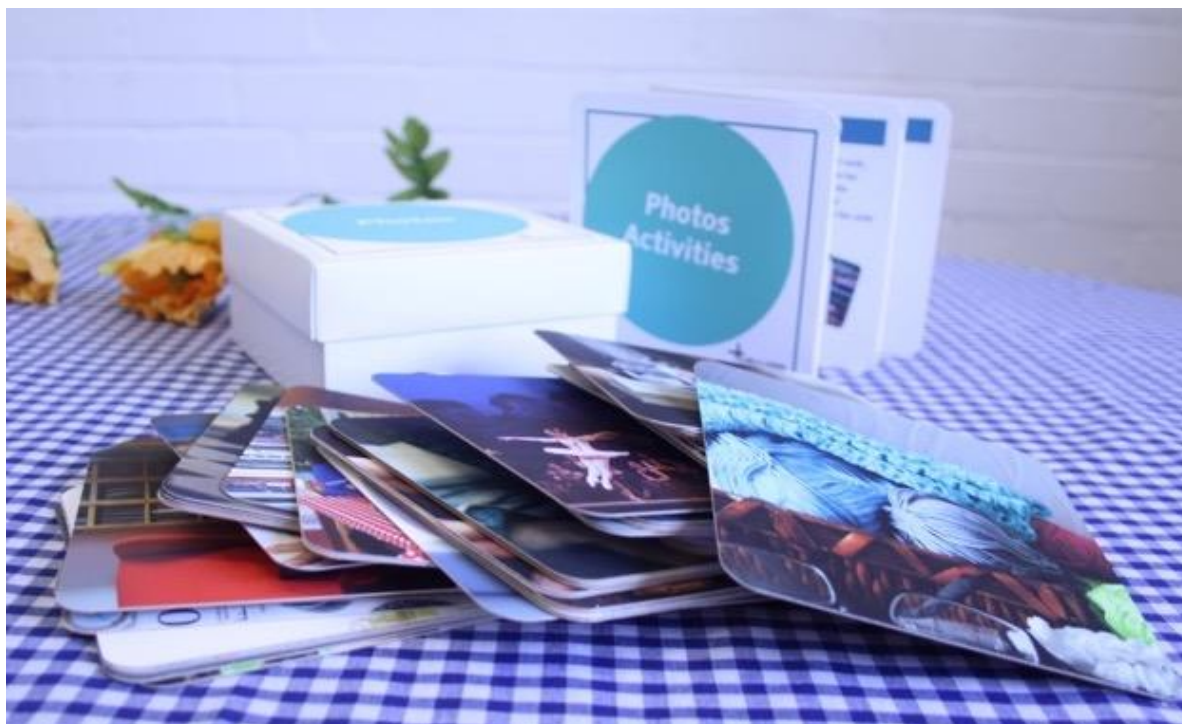
Figure 5: Life Café Photographs

The methodology of using objects, analyzing data, generating themes, changing objects has been a form of behind the scenes co-design. Participants have shaped the contents of the box and enabled others to talk about sensitive topics more easily, without really realizing. This iterative co-design process has occurred through every element, activity and resource included in the Life Café Kit, even the graphic design and the packaging design.