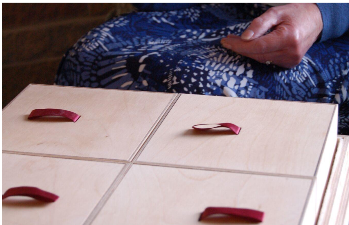
Figure 3: Exhibition in a Box

In some ways, Exhibition in a Box combines the two methodologies described above. Where object elicitation typically relies on participants having to hand their own meaningful objects, Exhibition in a Box provides everyday objects that we can easily relate to, and express our experiences through. And whilst critical artefacts have typically been designed objects for the research purpose, the objects in the box are more easily recognised as everyday things which we can think critically or metaphorically around expanding our imagination. This slightly more abstract approach is a way for people to be able to talk more freely, using the objects as starters for conversations. It was felt The Design to Care Programme needed a hybrid methodology, like Exhibition in a Box, to engage with community groups in a creative way.