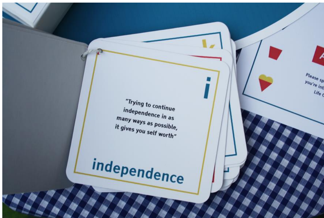
Figure 6: Life Café Participant Quotes