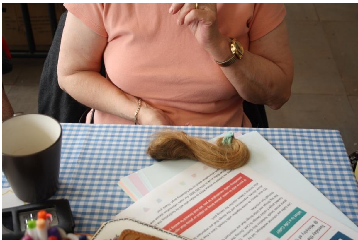
Figure 2: Life Café, Objects of Importance

Objects play a big part in our everyday life, they hold memories, feelings and stories. The researchers wanted to get to know life Café attendees through objects that they described as special to them, and so asked participants to bring in their own objects. These included badges, teddy bears, a mug and even a lock of hair. This was quick way to understand more about the participants and their life, outside of the room, in a rich qualitative way and would be described as object elicitation.