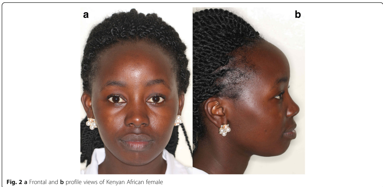
Fig. 2 a Frontal and b profile views of Kenyan African female

the South Indian population, in general, had a wider lower face while NAW showed wider midface and overall greater values of proportional indices than North American Caucasian population [6, 7]. A Turkish population study clearly shows anthropometric variation for fronto-occipital, circumference, intercanthal distance, outer canthal distance, near and distant interpupillary distance, canthal index, and circumference-interorbital index with age [9].