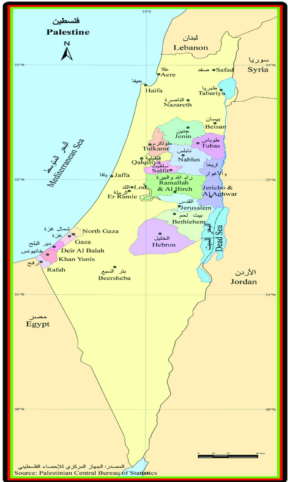
Fig. 1 Map of Palestine; Ramallah, and Al-Bireh district location is indicated in green color