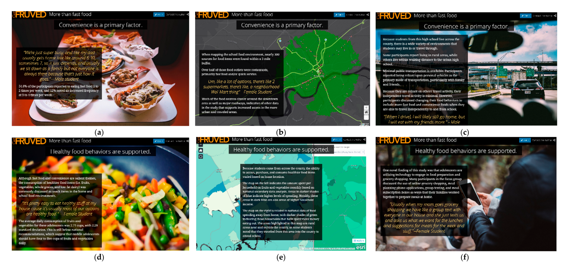
Figure 2. Pictorial depiction of online, interactive story map as follows: ( a ) Start of convenience section where fast food is depicted for family meals and embedded quote from focus groups; ( b ) next convenience section where school food environment with buffer zone and identified food outlets are shown; ( c ) transportation shown with narrative regarding dependent travel activity and embedded quotes from focus groups; ( d ) the next section depicting support of healthy behaviors starts with cooking skills; ( e ) mapping of county region from Prong 1; ( f ) use of technology with meal planning and preparation shown.