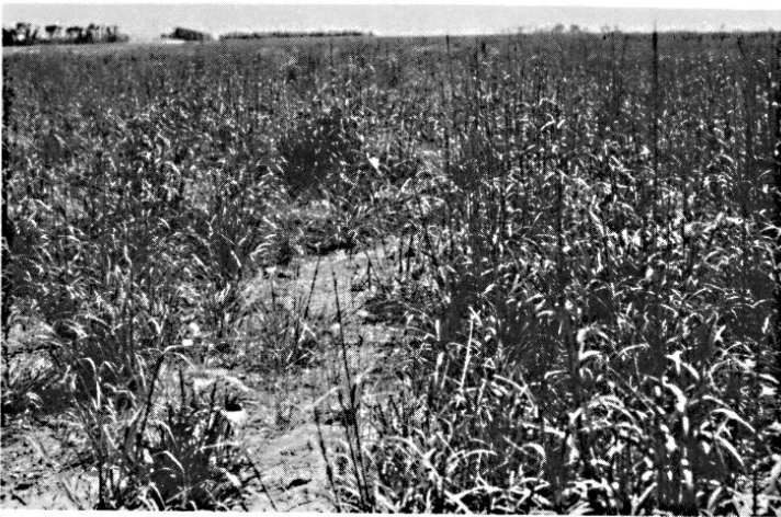
Fig. 2. This pasture was a seeded warm-season pasture which had been dominated by smooth brome and Kentucky bluegrass prior to atrazine application (2.2 kg/ha) in April 1982. The vegetation response was evident by July 1982 as indicated by the photograph. Bare ground represents Kentucky bluegrass and smooth brome patches which were suppressed with the herbicide. The estimated yield of warm-season grass was in excess of 5 MT/ha.

However, the 2.2 and 3.3 kg/ha rates of atrazine provided shifts from cool- to warm-season components of yield without reducing total yield. Differences between the low and medium atrazine rates were still greater than between the medium and high rates.