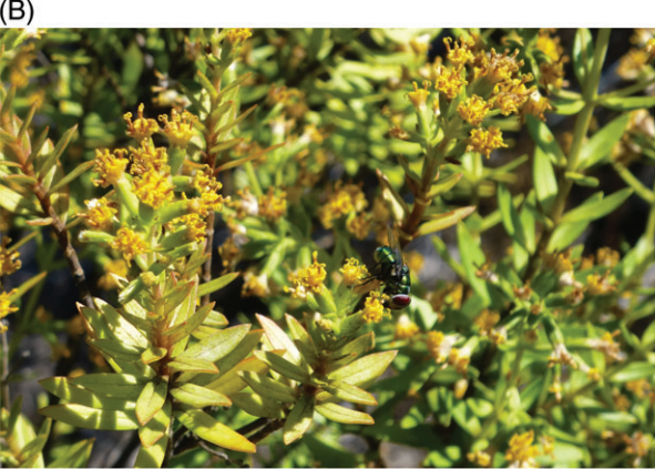
Figure 1. Flower visitors, (A) native Mestalobes sp. and (B) non-native Chrysomya megacephala , to the endemic Dubautia linearis in a high-elevation Hawaii dryland forest. Pollination in this system is almost exclusively being performed by non-native flower visitors, resulting in a functioning ecosystem with a novel species assemblage and raising the question of whether a new ecological state has emerged in this system. Depending on the definition of the state , it may be that the key stressor is native species extinctions or non-native species invasion, and it may be that success would emerge from fine- scale species-level management or from broad- scale habitat restoration or the existence of functional pollination networks. Careful consideration of each of the 4S's is essential to select management activities and evaluate their outcomes.

is persistence in certain patches sufficient? Should they work on bolstering pollinator habitats at a broad scale or introducing and monitoring individual pollinator populations at fine scales? Does success signify that native plants are receiving pollination, that historic native plant/native pollinator relationships are restored across the landscape, that each species persists somewhere, or that native biodiversity is bolstered as much as possible in any form (a value for land managers and the public). Finally, in addition to the stressor of species extinctions, other stressors will dictate which management activities can be adopted. For example, invasive species have introduced novel predation and fire regimes to the region (D'Antonio & Vitousek 1992; Hanna et al. 2013), complicating future pollination management by impacting native pollinator populations as well as native, fire-susceptible plants; it may be necessary to remove some of these non-natives before attempting pollinator restoration. The four S's steer decision-making in this system by illuminating value systems.