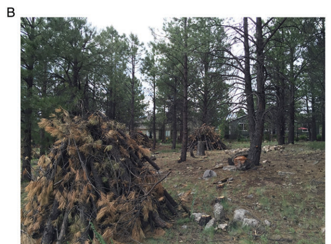
Figure 2. Applied resilience planning process. (A) A careful examination of the 4S's of applied resilience is necessary in order to select resilience planning strategies that will enhance resilience of a valued social—ecological state. Note that stage D of the process suggests monitoring and review, with a plan to repeat the process as necessary following adaptive management principles. (B) Thinning treatments such as those utilized in case study 2 provide a real-world illustration of the elements essential to applied resilience planning. The social—ecological state consists of dense forests at risk of high-severity fire (a major stressor ) following decades of fire suppression, but private property owners value these cool, shady forests, leading to social—ecological tension about the scale at which thinning should occur and the state forest characteristics that would represent success . Under circumstances such as these, a priori identification by stakeholders of each of these elements (mutual understanding of the stressor, desired forest state, appropriate and feasible scale, and metrics of success) is essential before management activities can occur.

Resilience has been used in a largely abstract fashion (Martin 2004; Standish et al. 2014; Hosseini et al. 2016), making it easy to insert into policy without contributing meaningfully to conservation of valued systems or resources. We recommend that resilience planners adopt an applied resilience planning process by which every resilience management effort begins with deliberate delineation of the stressors, system states, scales, and metrics of success that are applicable to the project and its objectives.