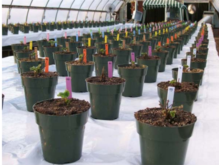
Fig. 1. Experimental layout for 13 strawberry cultivars. Each plant of each cultivar is represented by an unique number and tag color.

6 replications of four plants for each cultivar (the four plants/pots comprise the experimental unit), with 3 replications running north-south on each bench ( Fig. 1 ).