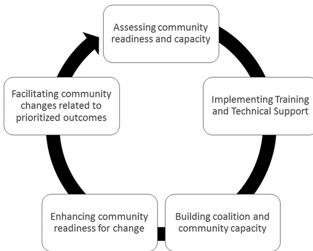
FIGURE 1 Conceptual model of coalition capacity and community readiness for change.

Note. SPF = Strategic Prevention Framework.