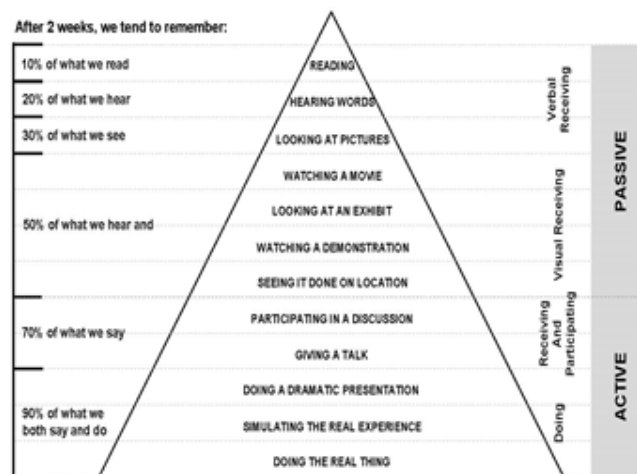
Figure 1: Cone of Learning (Adapted from Edgar Dale, Audio-Visual Methods in Teaching . Holt, Rinehart, and Winston, 1963)