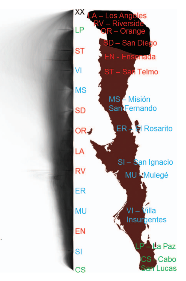
APPENDIX FIGURE 2. Geographic localities shown on right and color-coded by California Gnatcatcher ( Polioptila californica ) subspecies (red = P. c. californica , blue = P. c. margaritae , green = P. c. abbreviata ). The cloudogram in the center depicts a large degree of allele sharing among localities throughout the range, which is inconsistent with described subspecies boundaries. XX denotes the outgroup, P. melanura .

though easy to visualize, do not capture the complexity of the Bayesian tree probability space exploration and the density distribution of allele sorting. Moreover, to portray the rampant amount of allele sharing at the earliest stages of population divergence and the uncertainty of gene tree estimation, we plotted trees in the 95% posterior clade credibility distribution as a cloudogram in DensiTree 2.0 (Bouckaert 2010) using consensus tree plots that reflected the frequency of a given topology by its intensity. Cloudograms allow the finding of dominant topologies and delimiting of clades—if groupings do exist—despite the state of allele sorting in a given group (Bouckaert 2010).